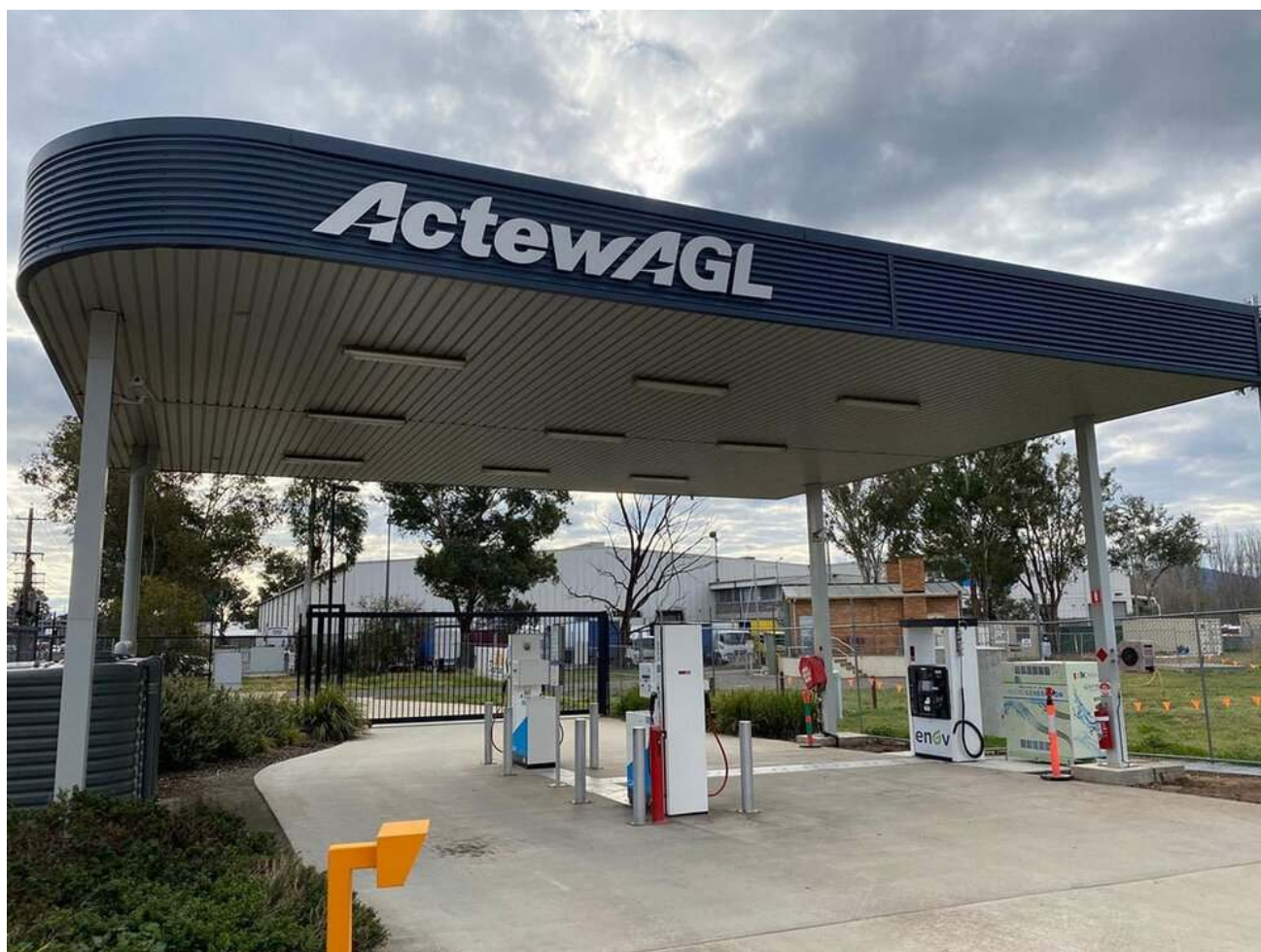
Figure 1: First Australia hydrogen retail station built in Canberra, Australia

Frontier has placed an order to enable it to build a hydrogen refuelling station in Perth, Western Australia. The order was placed with ENGV, who will work with IVYS Inc. and PDC Machines Inc., a partnership that has recently delivered the first hydrogen refuelling station in Australia. The development of this project will be the first of its kind in Western Australia, with targeted completion by 2023.