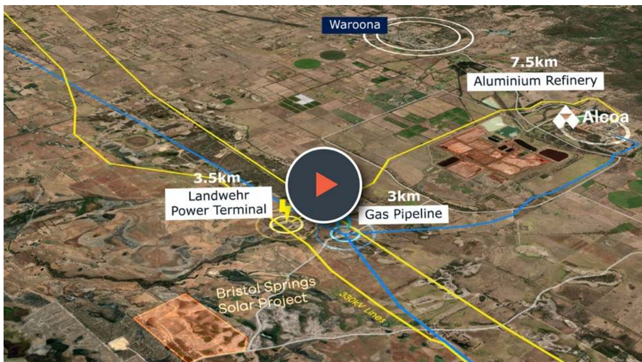
Figure 1: Click on the image to view a Virtual site trip to the Bristol Springs Solar Project (or visit the Company's website- www.frontierhe.com/videos/ )

Additional opportunities are available surrounding the Project that could allow an increase in solar power generation of up to ~490MWdc (see below).