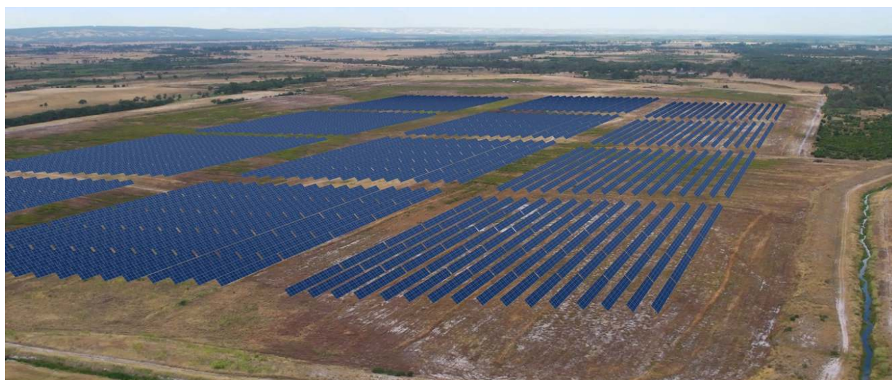
Figure 1: BSS Project with animated solar panel array

Solar energy is dominated by rooftop solar in WA, but according to RenewEnergy.com.au, there are currently only five industrial solar projects (200MWdc total capacity) connected to the SWIS in Western Australia. The BSS Project Stage One alone would account for approximately 36% of this production by 2024 based on current projections.