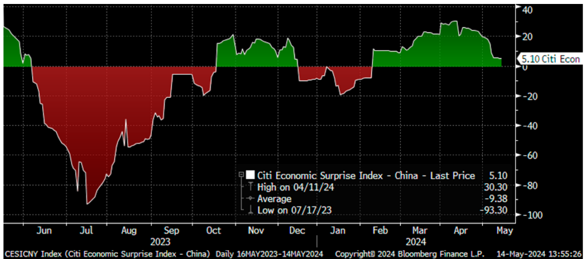
CHART 2: Citi Economic Surprise Index for China (5/16/23 - 5/14/24)