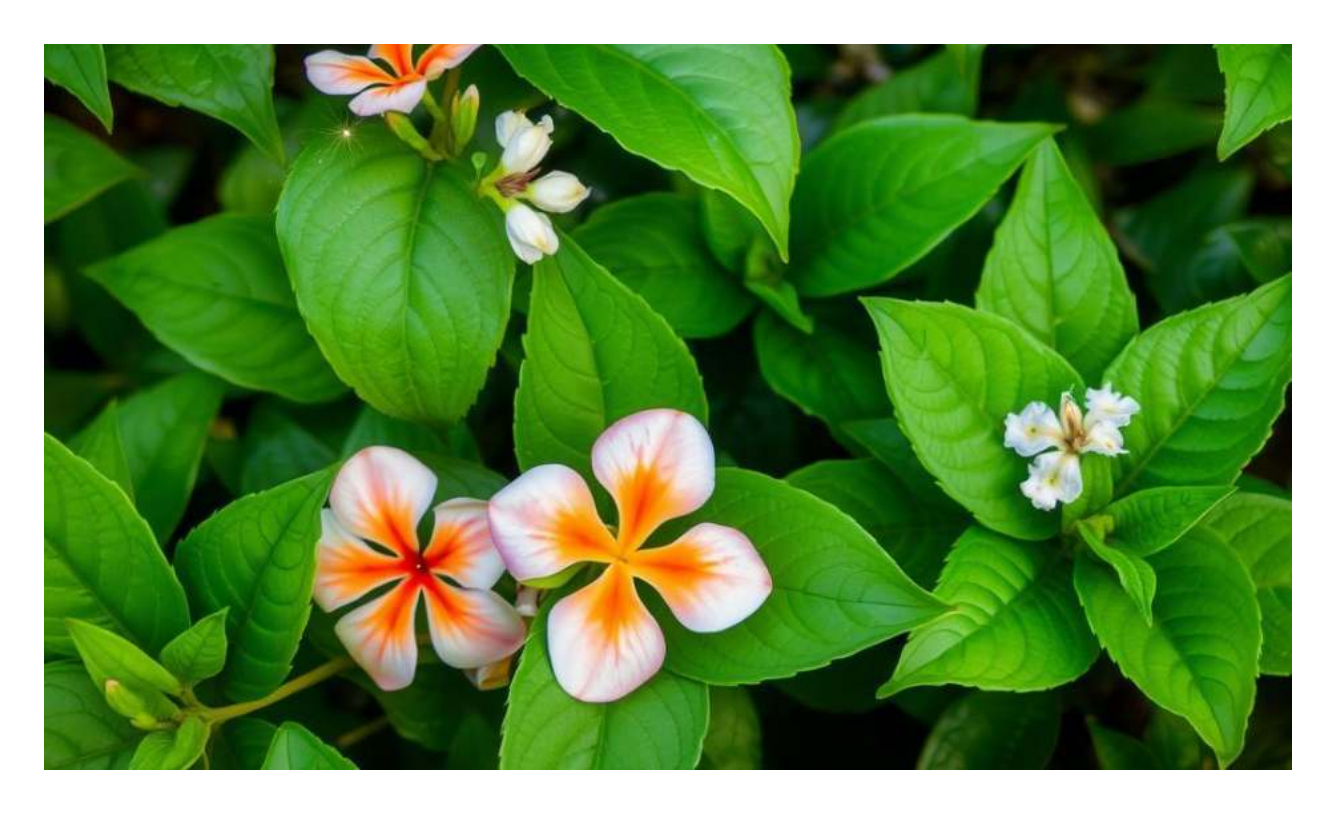
For a better deal, the ultimate pack has 4 bottles of serum and 2 bottles of Total Cleanse for $294, making each bottle $49.

There are bundles for different needs. The most popular is 2 bottles of serum and 1 bottle of Total Cleanse for $177.