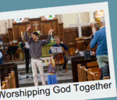
Worshipping God Together