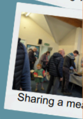
Sharing a me