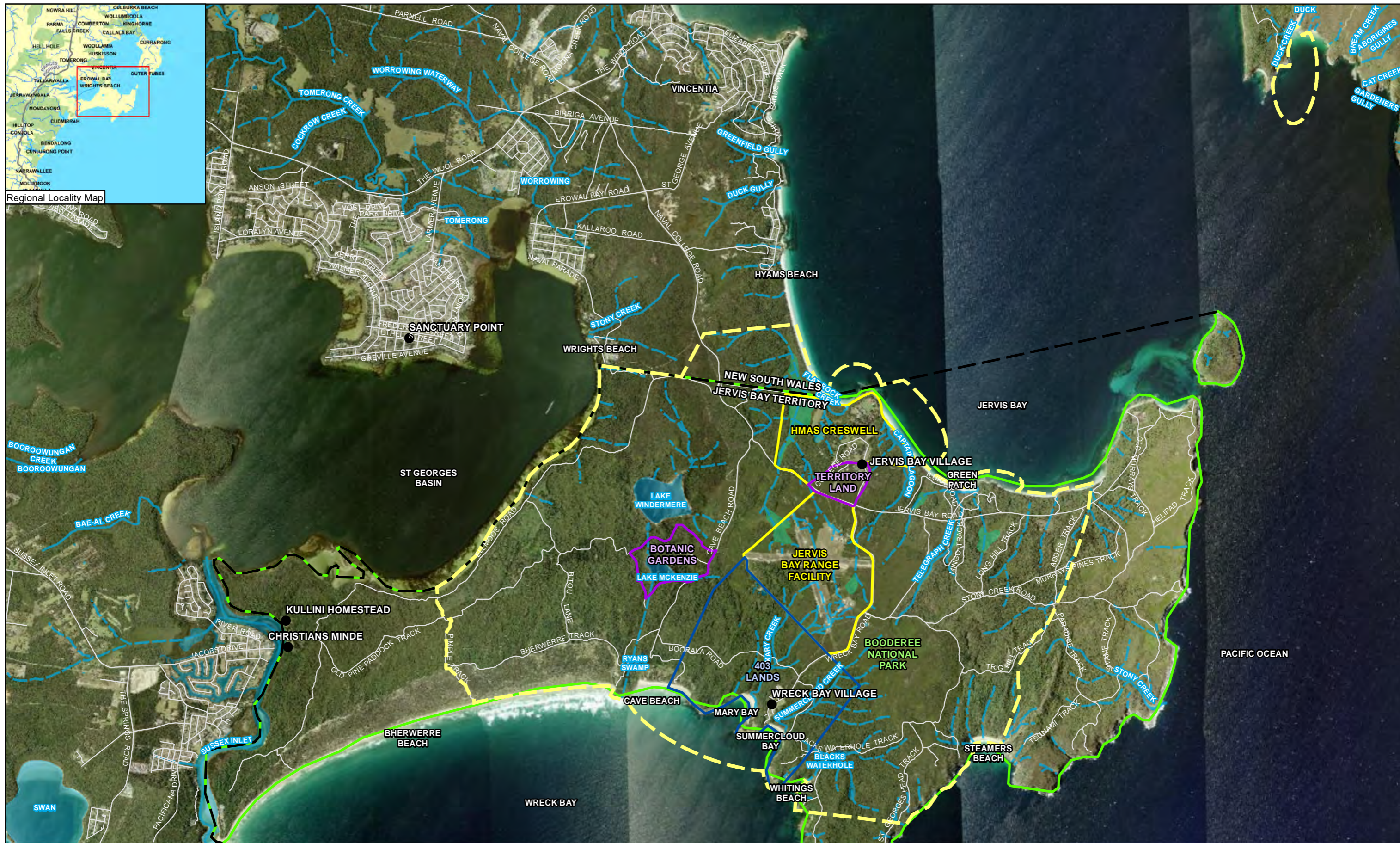
Regional Locality Map