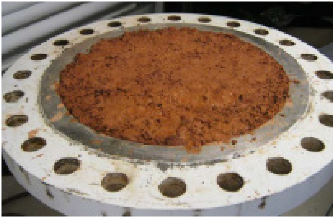
Figure 2b: soil from the site on top of geomembrane in the test cell