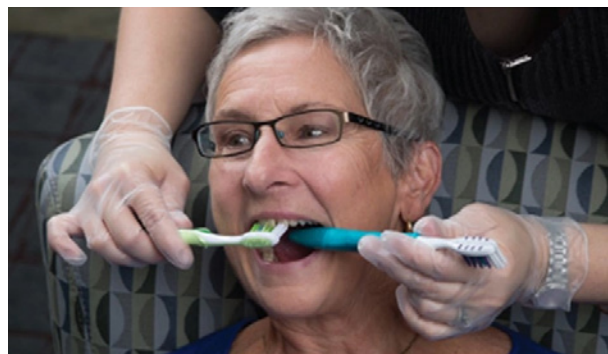
Figure 3 - Two-Toothbrush Technique 11

daily mouth care, they should be trained to identify and document any abnormalities. Healthy oral tissue should be pink, firm, and moist, without bleeding. Any white or red lesions, as well as cracks, chips, or dark areas on the teeth, should be documented and reported for follow-up care. Additionally, caregivers should ask daily screening questions such as, "Do you have any pain in your mouth?" or "Is anything in your mouth bothering you?" to uncover potential issues that may require further attention.