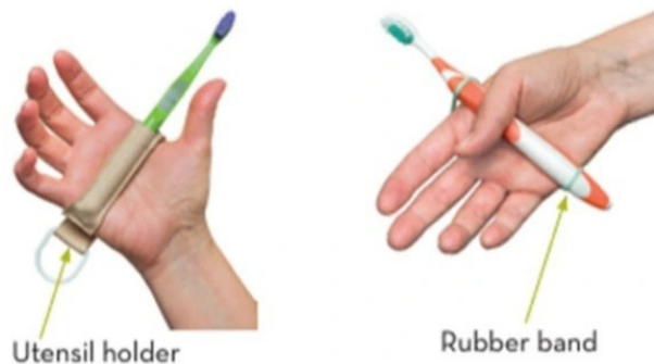
Figure 2 - Toothbrush Modifications 11