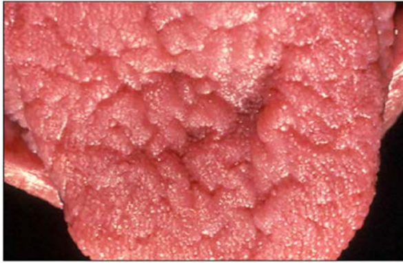
Figure 1A. Drug-induced Dry Mouth.