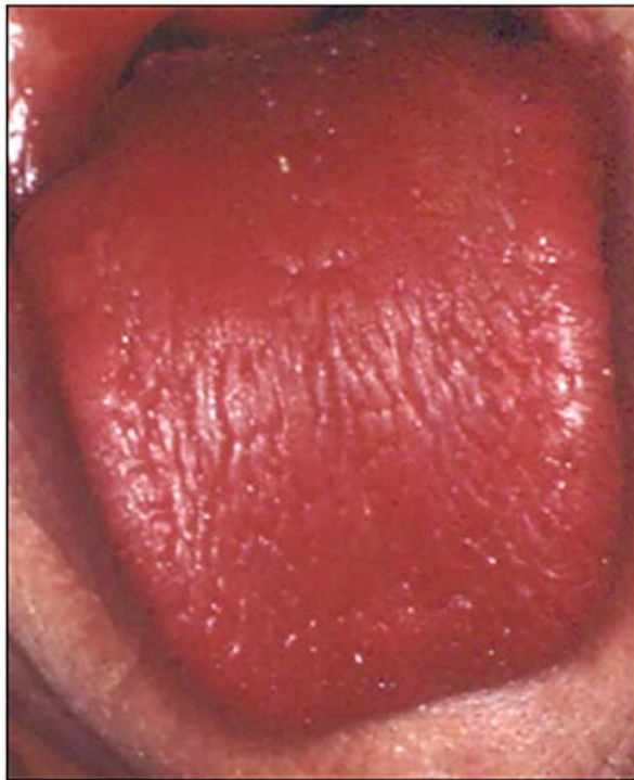
Figure 1B. Drug-induced Dry Mouth.