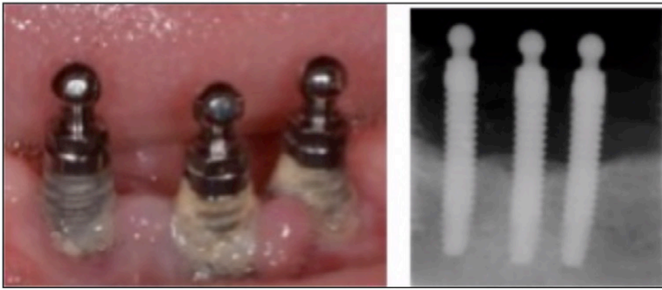
Figure 2. Peri-implantitis clinical and radiographic presentation.

treatment, if necessary. Establishing ideal overall health, plaque control, and compliance with professional maintenance is critical to the long-term success of therapy. Once it is established that it is possible for the patient to maintain good oral health, site-specific assessment should be performed to determine if defects can be repaired. Additionally, assessment of the best treatment option for the individual patient and site should be undertaken. This assessment should include an evaluation of the implant and/or prosthetic component mobility, peri-implant defect dimensions, and condition of the implant should be undertaken to allow for optimal customization of the treatment protocol.