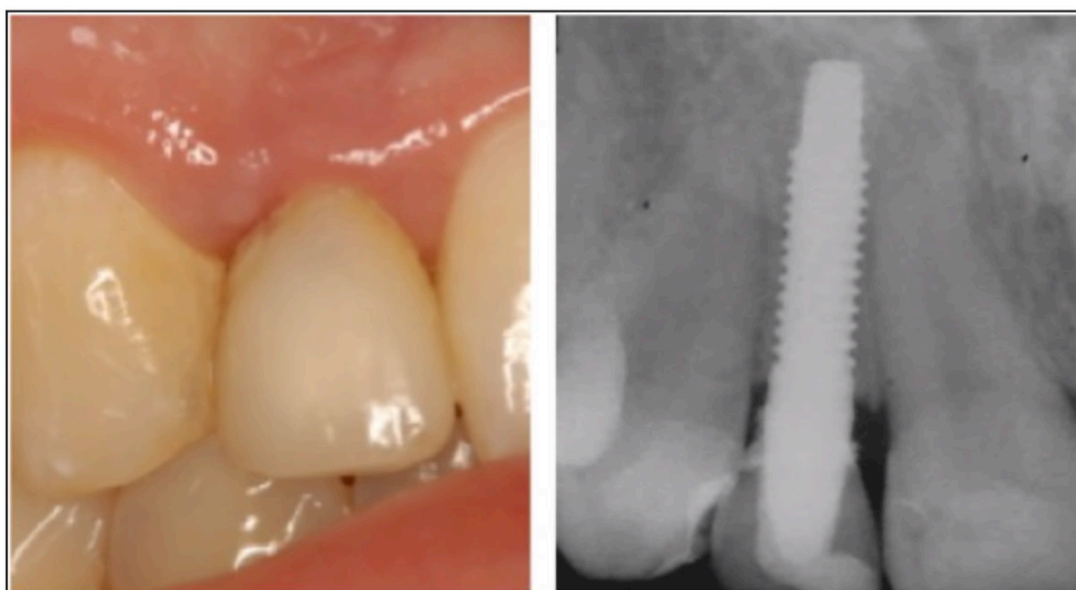
Figure 1. Peri-implant mucositis clinical and radiographic presentation.