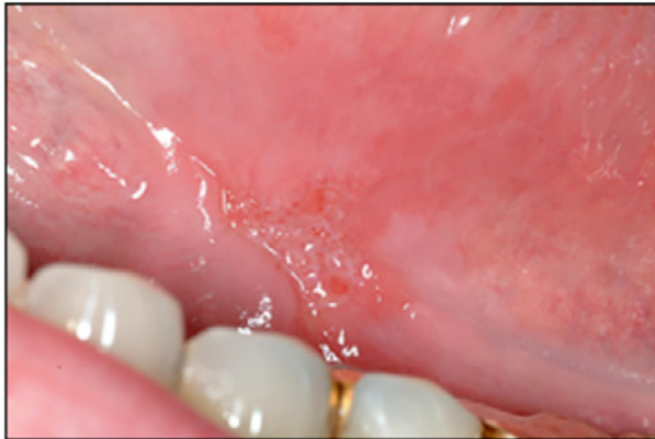
Figure 2. A small SCC of the ventral tongue presenting as a non-healing ulcer.

If the pathologist reports the lesion as cancer, then the patient should be referred promptly to a cancer treatment center for assessment and treatment. An important component of the assessment is to establish the stage of the disease. Similar to cancers at other sites in the body, cancer of the mouth is staged using the TMN system where T stands for tumor