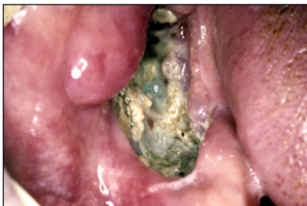
Figure 6. Osteoradionecrosis of the mandible. This patient had received radiation therapy for a tongue SCC in the past.

Overall, the five-year survival rate for oral cancer is 40-50%. Generally, the further anterior in the mouth the tumor occurs the better the prognosis. For example, over 90% of patients with cancer of the lower lip can expect a cure. For cancers involving the posterior tongue that are not associated with HPV16, the rate can be less than 30%. The presence of tumor in regional lymph nodes further reduces the overall 5-year survival rate by one-half. The