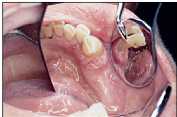
Figure 5. An SCC of the mandibular gingiva presenting as a non-healing ulcer.