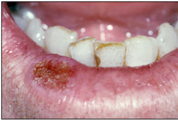
Figure 1. An SCC of the lower lip presenting as an ulcer. Notice the lack of a defined vermilion border and edema consistent with the SCC arising in the setting of actinic cheilitis.

and tumor suppressor genes such as p53 . The other is based on epidemiological evidence that has linked exposure to exogenous agents to the development of specific forms of cancer. For example, epidemiological studies have strongly implicated chemical carcinogens, such as those in tobacco, with lung and laryngeal cancer. Exposure to ultraviolet light has been strongly associated with carcinoma of the lower lip. Additionally, evidence is emerging for the role of specific viruses in cancers such as those arising in hematopoietic and lymphoid tissues, those of the uterine cervix and carcinoma of the oropharynx. 3