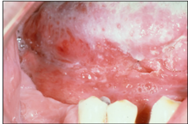
Figure 3. An SCC of the ventral tongue presenting as a red and white lesion.