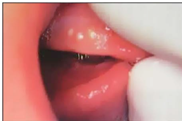
Figure 4. Dental Lamina Cysts (gingival cyst).