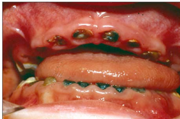
Figure 8. Late or severe form of ECC.