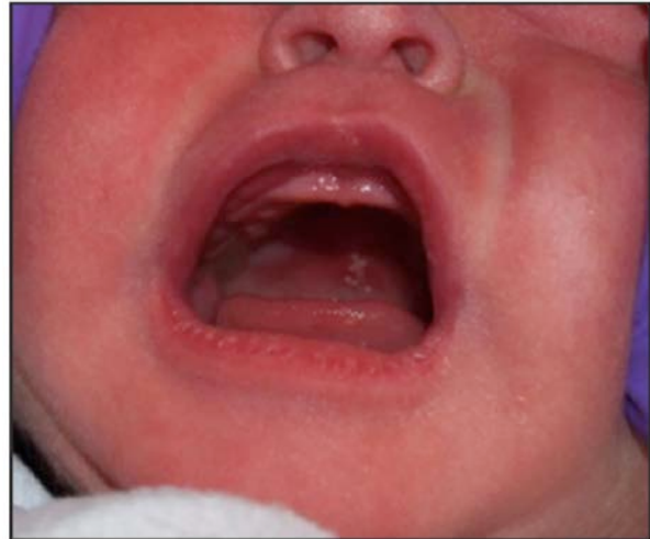
Figure 5. Epstein Pearls (palatal cyst).