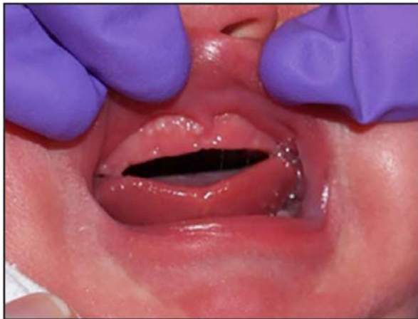
Figure 3. Bohn Nodules (palatal cyst).

These can incorrectly be diagnosed as natal teeth.