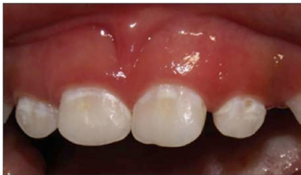
Figure 7. Initial white decalcification of the anterior teeth and incipient caries lesion.