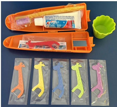
Dental Care in a Carrot®

In Part 1 of this course oral health literacy is discussed, and Part 2 of the course goes through the steps in detail that are important to present in the Lessons in a Lunch Box program. Historical data is provided on the research that has been done confirming the need to improve the quality of lives through innovative oral health educational programs and strategies.