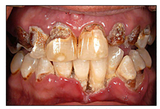
Figure 8. Declining periodontal health.

Methamphetamine users have an increased incidence of periodontal disease.70 A study conducted by the University of California noted that 37% of adults aged 35-49 in the US general population have periodontitis whereas 89% of subjects utilizing methamphetamine presented with periodontitis. 70 The drug causes vasoconstriction of the vessels that supply blood to the oral tissues. With repeated use of the drug and repeated vasoconstriction, the blood vessels are permanently damaged, and the oral tissues die. Methamphetamine users often exhibit significant inflammation and destruction of the hard and soft tissues of the mouth. The etiology of the destruction is not clearly defined. One theory suggests that the