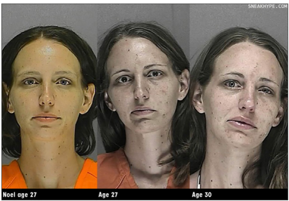
Figure 4. Physical effects of methamphetamine use.

The potent crystal meth is particularly prevalent among men who have sex with men (MSM). MSM is the term used to categorize males who engage in sexual activity with other males, regardless of how they identify themselves. This term focuses on behavior rather than cultural or social self-identification. Users report an amplified libido, increased sexual stamina and reduction of inhibitions.<sup>41</sup>