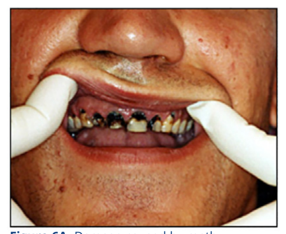
Figure 6A. Damage caused by meth.