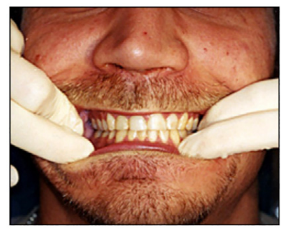
Figure 6B. Post-treatment.

treatment photo. There is a distinctive pattern of caries on the facial and proximal surfaces of teeth, especially the anterior teeth. It is an aggressive erosion of enamel accompanied by destruction of periodontal tissues. Teeth have been described as blackened, stained, rotting, crumbling or falling apart. The rampant caries resemble radiation caries, early childhood caries or "pop rot" but lacks the associated etiology. Through elimination of other causative agents, a differential diagnosis of meth mouth can be made.