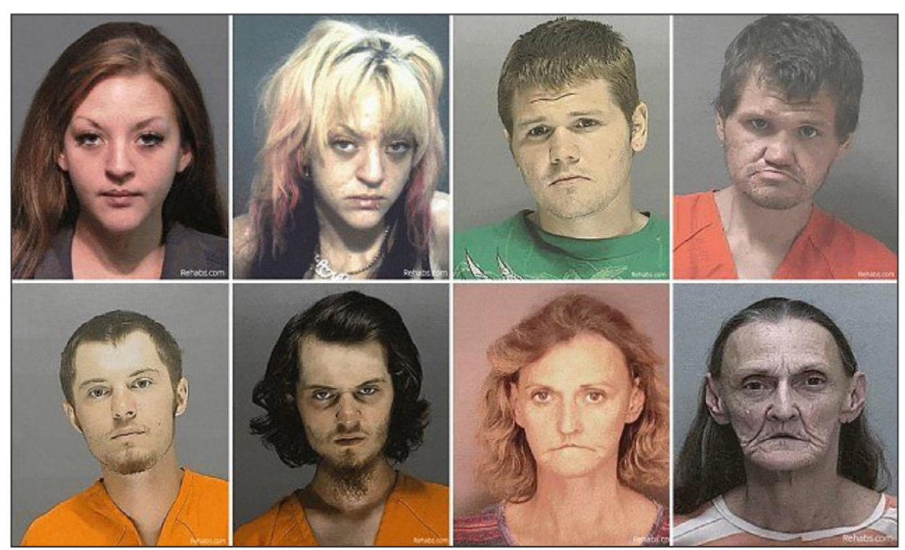
Figure 5. Physical effects of methamphetamine use.

As a result, there is an increased incidence of HIV/AIDS and hepatitis B and C, primarily due to sharing of needles and unprotected and rougher sex. Antibiotic resistant forms of sexually transmitted infections and more virulent forms of AIDS are being observed in meth users.