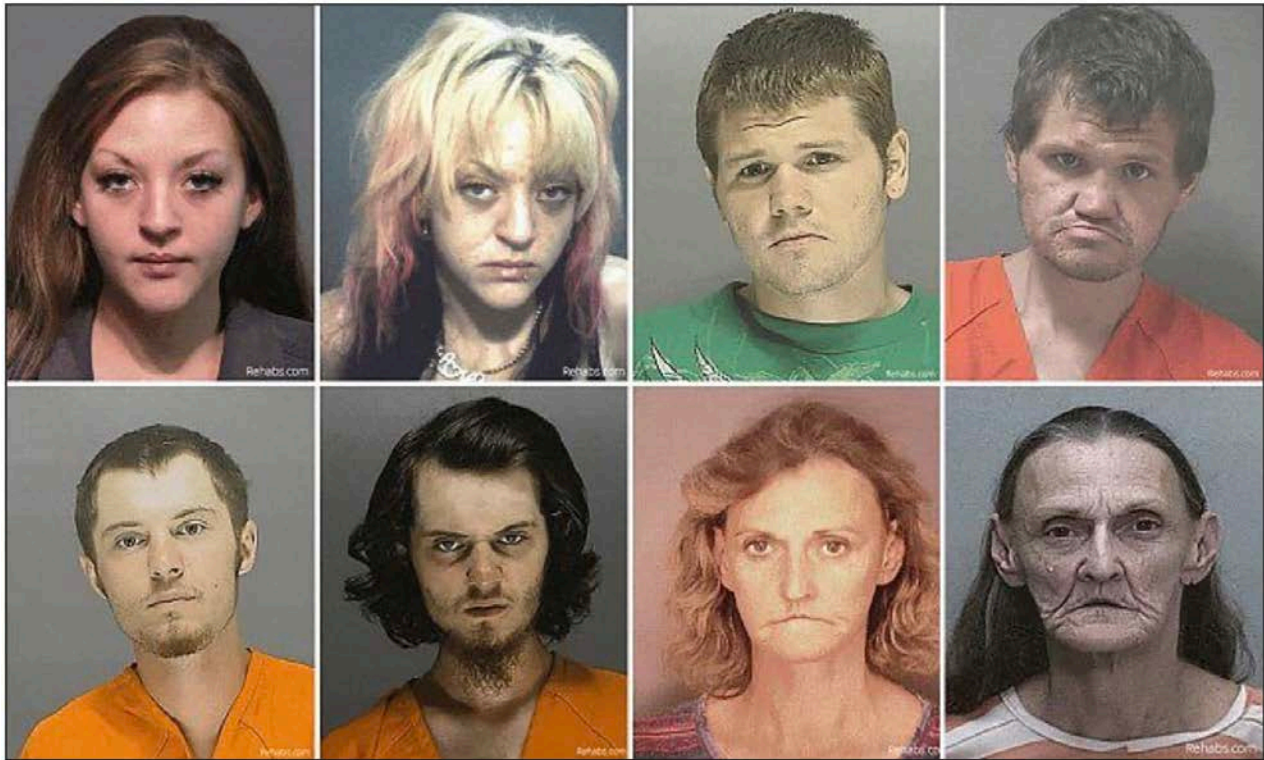
Figure 5. Physical effects of methamphetamine use.