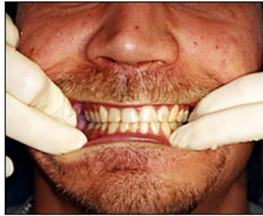
Figure 6B. Post-treatment.