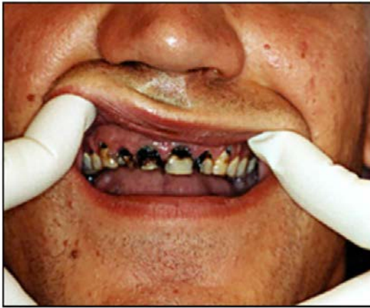
Figure 6A. Damage caused by meth.