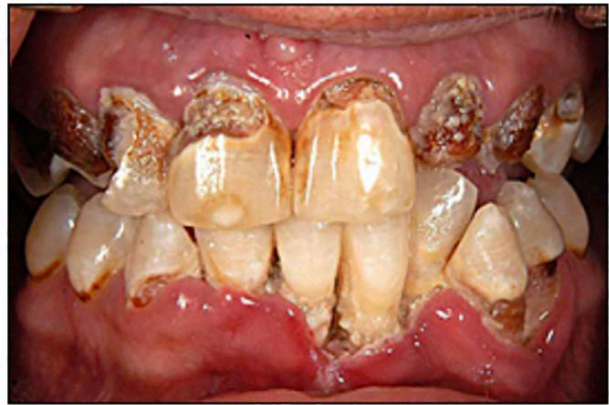
Figure 8. Declining periodontal health.