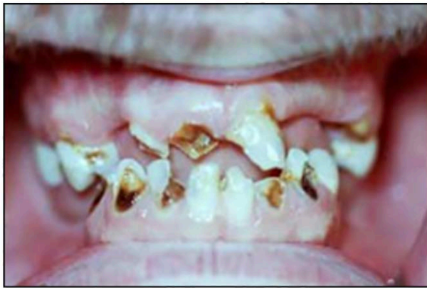
Figure 7. Significant and rampant caries.