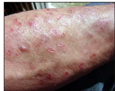
Figure 3. Lesions and scabbing on the legs.