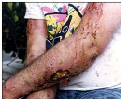
Figure 2. Lesions and scabbing on the arms.