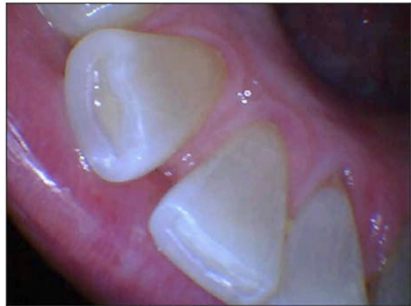
Figure 1. Attrition exposing dentin on tooth #25.

Attrition is the normal loss of tooth substance that results from friction by physiologic forces. 7 Dental attrition is caused by tooth-to-tooth contact, resulting in loss of tooth tissue, usually starting at the incisal or occlusal surfaces. Clinical crown damage of the teeth can significantly thin the enamel structure, thus exposing the underlying structure called dentin (Figure 1). Dentin is softer and darker, increasing the risks of sensitivity, decay and discoloration. The etiology of dental attrition is multifactorial, with the most common cause being bruxism.