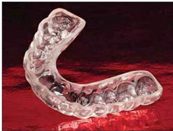
Figure 9. Night guard.

Night guards are one of the most popular treatment options for sleep bruxism (Figure 9). The goal of a nighttime therapy appliance is to redistribute occlusal forces, relax the masticatory muscles, stabilize the TMJ, protect the dentition and dental work, decrease the symptoms and, hopefully, reduce bruxism. 16,55 Night guards can last an average of a few months to years depending on the force and frequency of grinding. There are a variety of night guards; choosing and advising the patient on the correct night guard is important.