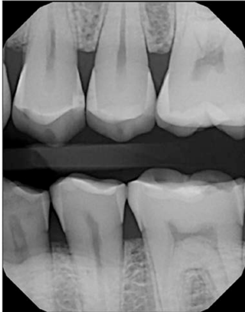
Figure 8. Thin enamel and flat mandibular cusps with widening of the periodontal ligament on tooth #13.

lasting, although the ceramic surface can be abrasive to the opposing teeth.