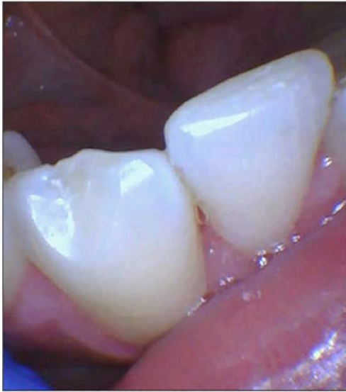
Figure 3. Facial surface exhibiting flattened, smooth, polished enamel wear on tooth #23.