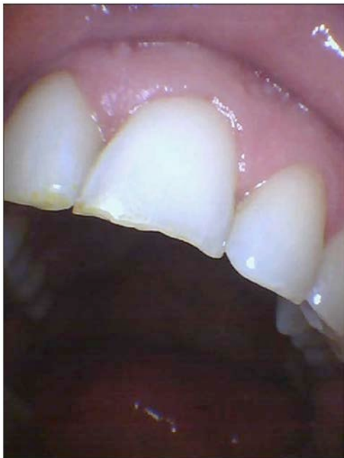
Figure 6. #9 - small chips #10 - flat, smooth incisal

cases the tooth may need to be extracted. The fracture begins on the outer surface of the tooth and eventually deepens until the crack enters the nerve, which leads into cracked tooth syndrome—an etiology of bruxism. 21,38