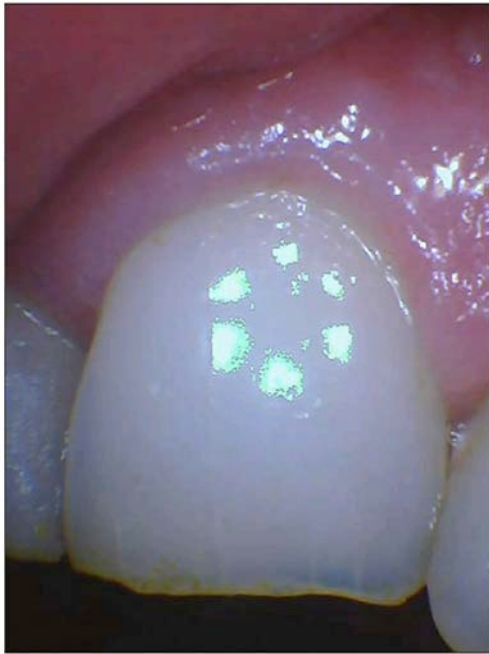
Figure 5. Jagged, chipped and thinning enamel on the incisal edge.