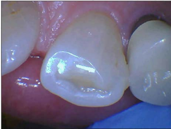
Figure 4. Lingual and occlusal surfaces exhibiting polished wear on tooth #5.

flattened wear patterns on the enamel. This happens in unusual places for wear to logically occur through regular chewing. The distal corners of the maxillary central and lateral incisors are very common areas where damage from bruxism is noticed. Common canine wear facets are rounded over to the labial surface of the cusp tip, whereas normal mastication wear blends over to the lingual surface. 5