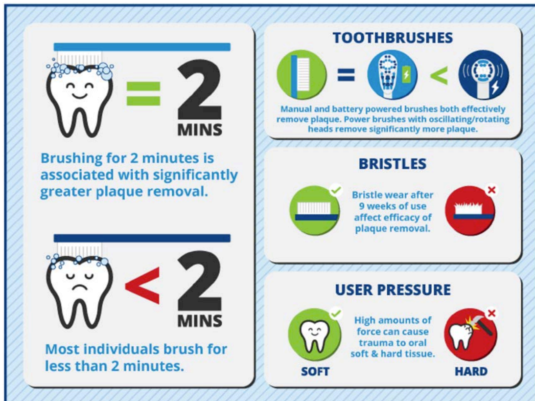
Figure 3. Oral Hygiene Recommendations.

Proper toothbrushing with both manual and power brushes, is effective for plaque removal on tooth surfaces, but may be limited in the removal of interproximal plaque. 72,73 Toothbrushing duration in periodontally healthy individuals is associated with a significantly greater amount of biofilm removal up to approximately two minutes. 74 It has also been suggested that for patients with periodontal disease, longer toothbrushing duration may be necessary. 7 Patients also generally brush for significantly less time than the recommended two minutes, even in instances where they are asked to brush for a full 120 seconds. 75,76 Selection of toothbrushes is important for optimal biofilm removal. While patients' perception indicates that harder