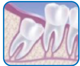
Soft tissue impaction of third molar