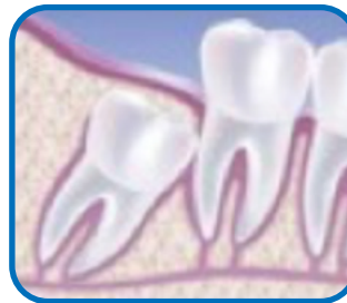
Angular, bony impaction of third molar (wisdom tooth)