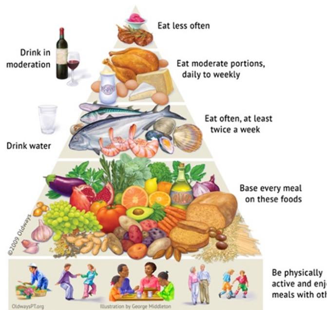
Figure 2: Healthy Mediterranean-Style Eating Pattern

is needed to better establish how these factors work together, studies have indicated positive results regarding the MD diet, weight control and oral health. More specifically, an intervention study found a beneficial change in the salivary microbiome in obese and overweight adults after following the MD for 8 weeks. These adults had a significant decrease in the pathogenic bacteria associated with periodontal disease: Porphyromonas gingivalis , Prevotella intermedia , and Treponema denticola compared to the control group who did not change their eating habits. 74 A cross-sectional study of 6,209 participants of the Hamburg City Health Study identified a significant association between higher adherence to the MD and reduced risk for developing periodontal disease. 75 In addition, a recent RCT published in the Journal of Clinical Periodontology looked at the effect of the MD on gingivitis and reported dramatic findings. After just 6 weeks following the MD, there was a significant reduction in gingivitis, periodontal inflammatory parameters and whole-body anthropometric parameters. 76