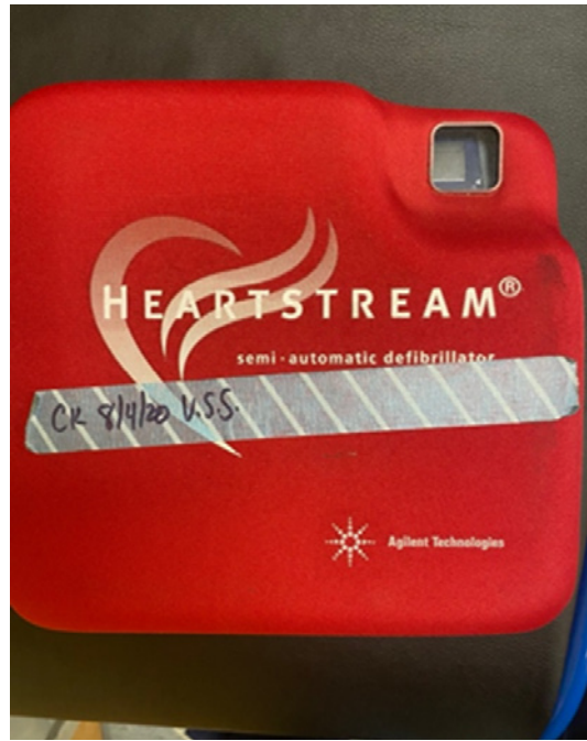
Figure 7. Automated electronic defibrillator (AED)