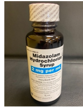
Figure 15. Midazolam (Versed) syrup