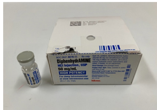
Figure 12. Diphenhydramine for parenteral use

In contrast, status asthmaticus is the most serious clinical condition that manifests with wheezing, dyspnea, and hypoxia. Patients with this condition do not respond to bronchodilators and it is considered as a true emergency.