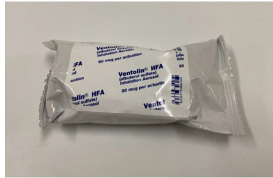
Figure 13. Ventolin (Albuterol sulphate) for inhalation.

If the patient uses a self-administered bronchodilator aerosol during acute asthmatic attacks e.g., albuterol (Proventil, Ventolin) isoproterenol (Isuprel) or metaproterenol (Metaprel, Alupent), they should bring it to their appointment. The bronchodilators produce bronchial smooth muscle relaxation. Albuterol has the least side effects of all the bronchodilators and should be the drug of choice for inclusion in the emergency drug kit. (Figure 13).