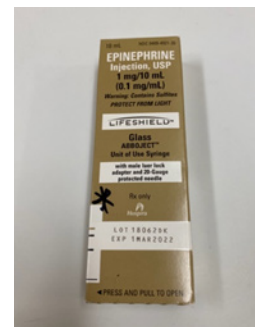
Figure 10. Epinephrine injection

While available in 1 ml ampules of 1:1000 (0.30 mg/dose) for adults and 1:2000 (0.15 mg/dose) for children that is drawn into and administered via a syringe ( Figure 10 ). A more efficient manner of administration during an emergency is with an EpiPen.