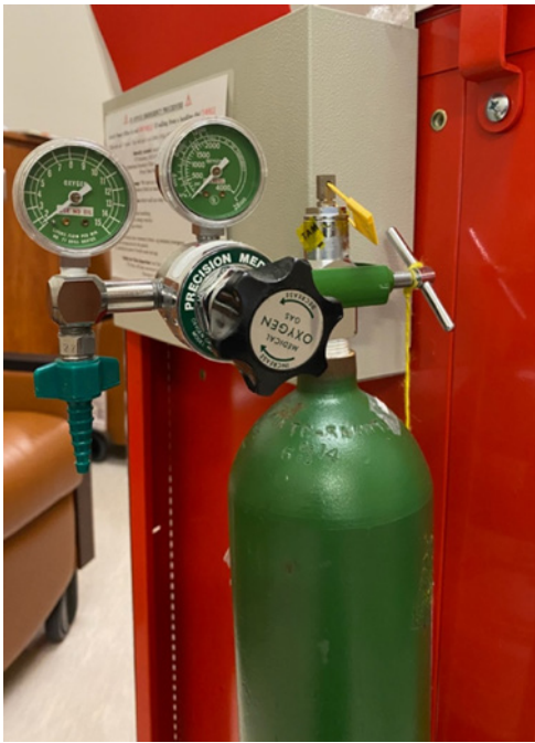
Figure 6. "E" Size Oxygen Cylinder.