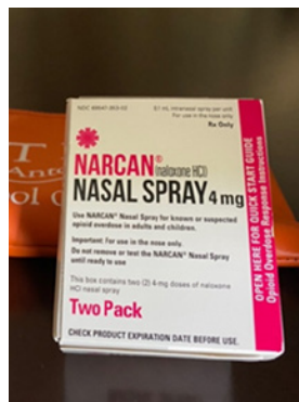
Figure 17. Naloxone nasal spray

call for emergency medical services and transportation for advanced care if indicated. 2,3,4,5