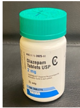
Figure 14. Diazepam (Valium) tablets