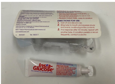
Figure 18. Insta-Glucose

If you're not sure if the patient's blood glucose level is too low or too high, give the glucose. There is no danger of giving too much.