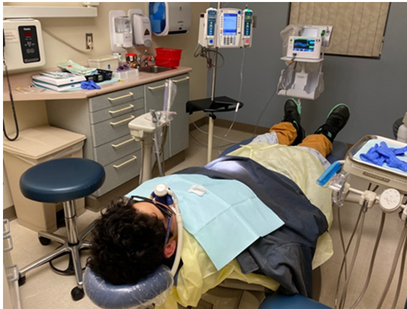
Figure 8. Pulse oximeter connected to a monitoring device on a patient receiving oral conscious sedation