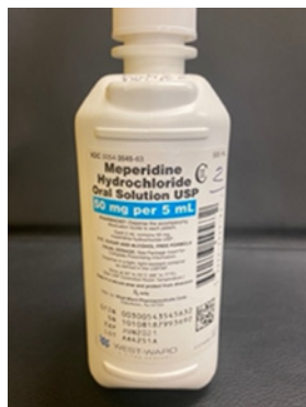
Figure 16. Meperidine (Demerol) oral solution