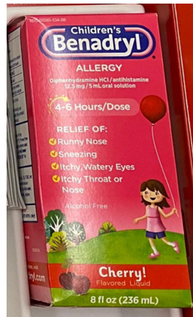
Figure 11. Diphenhydramine for oral use

Asthma is defined as a chronic inflammatory disorder that is characterized by reversible obstruction of the airways. Approximately 9.5% of children in the United States suffer from asthma. Asthma is the most chronic childhood disease that affects around 7.1 million children in the United States. 13 Half of all cases develop before patients reach 10 years of age. It appears more frequently in African American and Hispanic populations. Most of the acute asthmatic episodes are usually self-limiting.