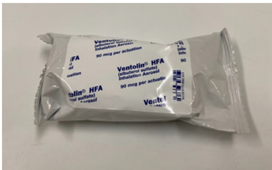
Figure 13. Ventolin (Albuterol sulphate) for inhalation.

If the patient uses a self-administered bronchodilator aerosol during acute asthmatic attacks e.g., albuterol (Proventil, Ventolin) isoproterenol (Isuprel) or metaproterenol (Metaprel, Alupent), they should bring it to their appointment. The bronchodilators produce bronchial smooth muscle relaxation. Albuterol has the least side effects of all the bronchodilators and should be the drug of choice for inclusion in the emergency drug kit. (Figure 13).