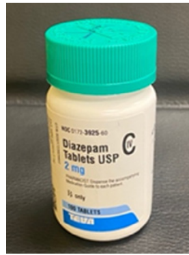
Figure 14. Diazepam (Valium) tablets