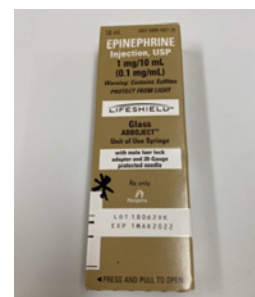
Figure 10. Epinephrine injection

While available in 1 ml ampules of 1:1000 (0.30 mg/dose) for adults and 1:2000 (0.15 mg/dose) for children that is drawn into and administered via a syringe ( Figure 10 ). A more efficient manner of administration during an emergency is with an EpiPen.