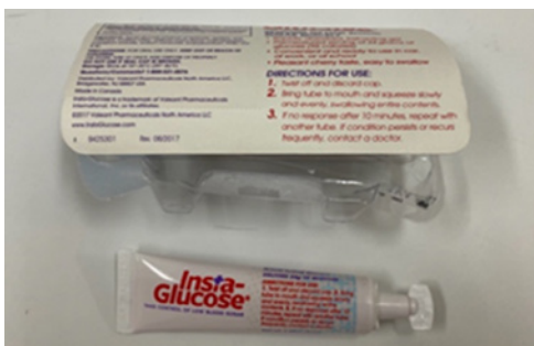
Figure 18. Insta-Glucose

Glucagon, a hormone secreted by the pancreas, raises blood glucose levels. It has an effect opposite that of insulin, which lowers blood glucose levels. The pancreas releases glucagon when blood sugar levels fall too low. Glucagon causes the liver to convert stored glycogen into glucose, which is released into the bloodstream. It is available in injectable form (Glucagon) for intramuscular administration.