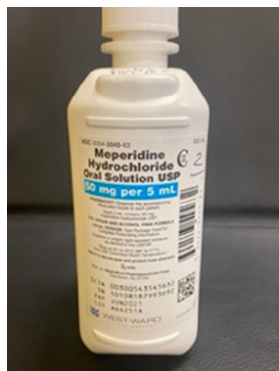
Figure 16. Meperidine (Demerol) oral solution

Diabetes mellitus is a disorder characterized by inadequate insulin production by the pancreas leading to compromised carbohydrate, fat, and protein metabolism. If untreated, it leads to hyperglycemia (increased blood glucose