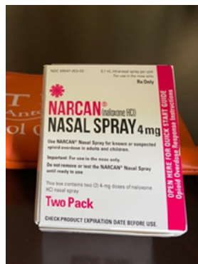
Figure 17. Naloxone nasal spray

levels). The most common type of diabetes in children is Type I diabetes (juvenile diabetes). It is diagnosed in about 1 in 400 to 600 children and adolescents in the United States. 18 There is little, or no pancreatic \beta cell function and thus daily injections of insulin are required. Blood glucose levels are difficult to control leading to emergencies involving hyperglycemia or hypoglycemia (decreased blood glucose levels).