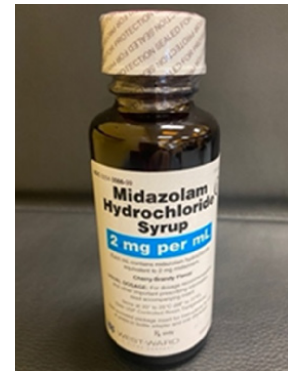
Figure 15. Midazolam (Versed) syrup