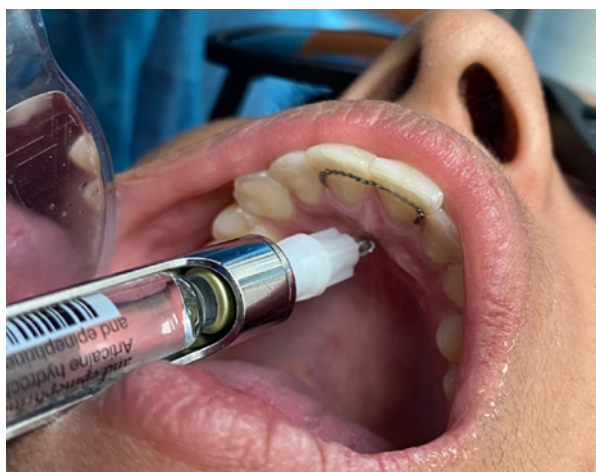
Figure 13. Nasopalatine nerve block