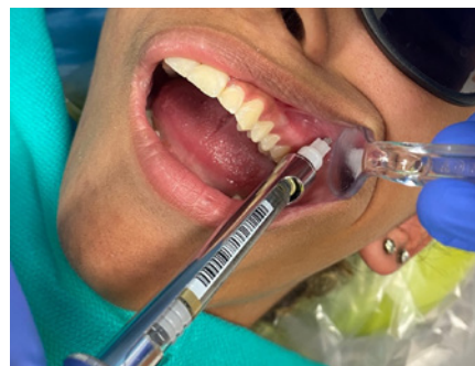
Figure 12. Posterior superior alveolar nerve block

For reasons already described, the posterior superior alveolar nerve block is used to anesthetize the second primary molar in the primary and mixed dentitions and the permanent molars in the mixed and permanent dentitions. The mesiobuccal root of the first permanent molar is not consistently innervated by the posterior superior alveolar nerve. Complete anesthesia of the tooth may need to be supplemented by a local infiltration injection (Figure 12).