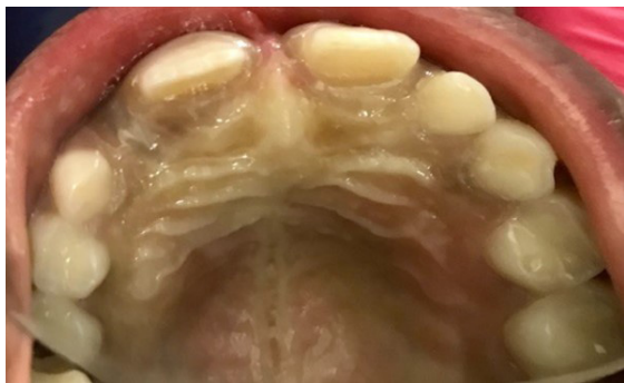
Figure 14. Blanching of the palatal mucosa following infiltration

The periodontal ligament injection has been used for a number of years as either a method of obtaining primary anesthesia for one or two teeth or as a supplement to infiltration or block techniques. The technique's primary advantage is that it provides pulpal anesthesia for 30 to 45 minutes without an extended period of soft tissue anesthesia, thus being extremely useful