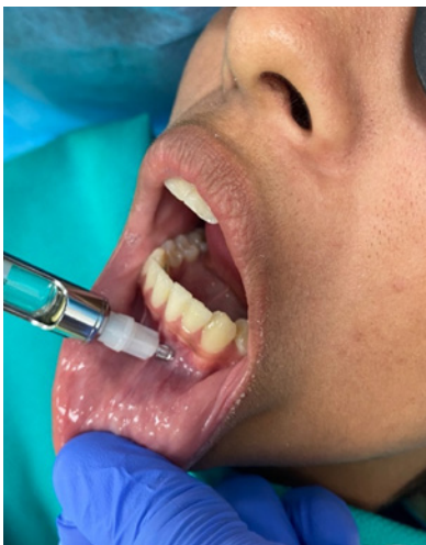
Figure 10. Infiltration for Mandibular Incisors