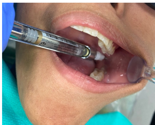
Figure 8. Inferior alveolar nerve block