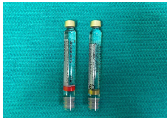
Figure 2. Local anesthetic cartridges (2% Lidocaine and 4% Septocaine)

circulation and increases its duration of action. It lowers the pH of the cartridge solution which may lead to discomfort during injection.