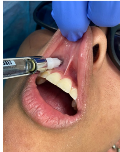
Figure 11. Local Infiltration of the Maxillary Primary and Permanent Incisors and Canines