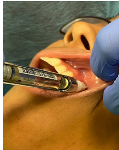
Figure 12. Infiltration of the Maxillary Premolars