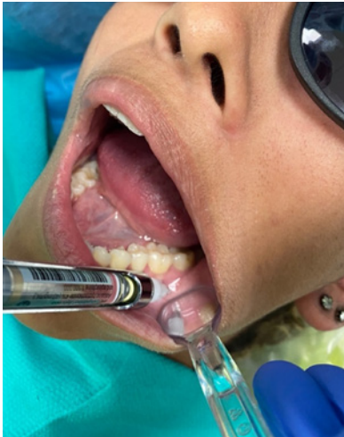
Figure 9. Infiltration of mandibular molars