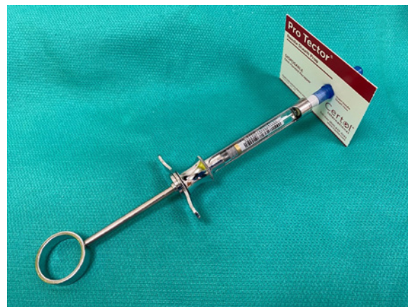
Figure 1. Local anesthetic syringe and cartridge with a needle sheath prop