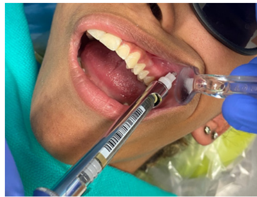
Figure 13. Posterior superior alveolar nerve block

The injection is indicated when a suprapariosteal injection is contraindicated (infection or acute inflammation) or when suprapariosteal injection is ineffective. It is contraindicated in patients with blood clotting problems (hemophiliacs) because of the increased risk of hemorrhage in which case a suprapariosteal or PDL injection is recommended.