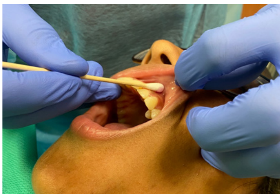
Figure 6. Application of topical anesthetic