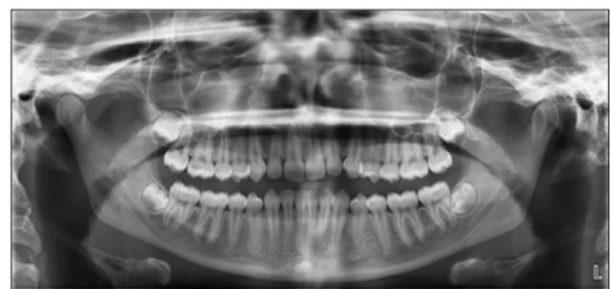
Figure 2. Panoramic Image Third Molar Evaluation.

Panoramic imaging can be utilized to assess tooth development, particularly the third molar teeth, to determine their presence, position and degree of development (Figure 2). Occlusal and/or periapical images can be used to determine the position of an unerupted or supernumerary tooth.