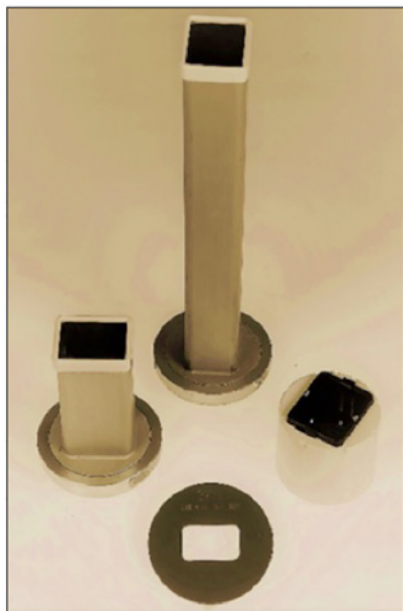
Figure 7. Rectangular Collimators.

has the added benefits of improving image geometry and reducing scatter radiation which degrades the resultant image. 4 This is especially applicable to intraoral digital receptors because they are more sensitive to scatter radiation than film. 31