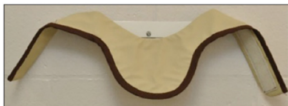
Figure 8. Thyroid collar.

The thyroid gland, given its anatomic location, is often in the path of the x-ray beam during intraoral imaging. The thyroid is one of the most sensitive organs to radiation-induced tumors and is particularly sensitive in children. 6 A thyroid collar (Figure 8) should be used on all patients during intraoral radiography which significantly reduces exposure to the gland.