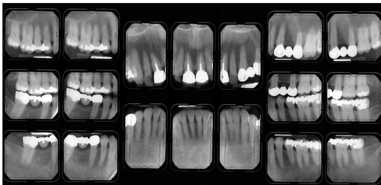
Figure 4. Full Mouth Series of Radiographs