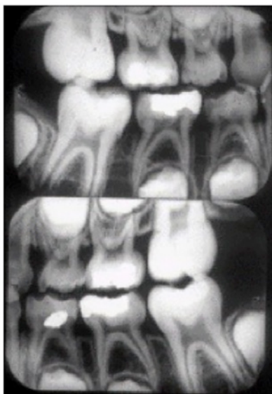
Figure 1. Child Bitewing Survey.

Although atypical, if clinical evidence of periodontal disease is observed in this age group, selected periapical and bitewing radiographs are indicated to determine the