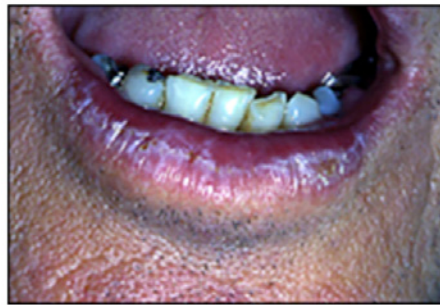
Figure 5. White/gray opalescent plaques of the vermilion - biopsy proven severe dysplasia.