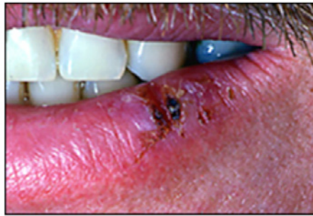
Figure 6. Waxing and waning erythematous ulceration with induration - biopsy-proven carcinoma-in-situ.