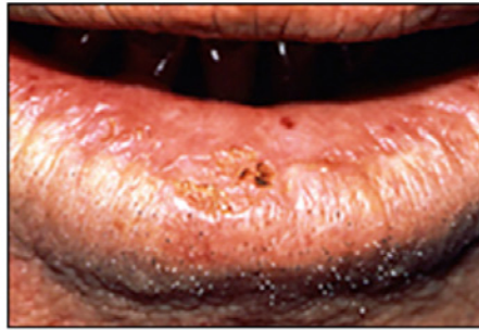
Figure 4. Isolated areas of crusting and loss of definition of the vermilion border - biopsy-proven moderate dysplasia.