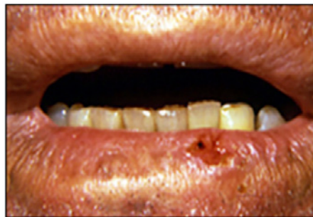
Figure 7. Persistent ulceration with induration and recent onset of pain - biopsy-proven invasive SCC.