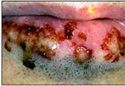
Figure 1. Blistering secondary to acute exposure to UVR.