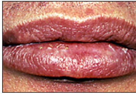
Figure 2. Solar cheilosis presenting as a dry, scaly, unobtrusive "chapped lip."