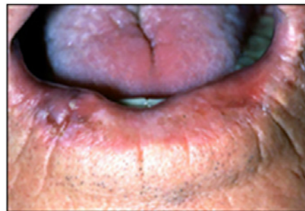
Figure 8. Biopsy-proven recurrent SCC with ulceration and induration 10 years after excision of primary SCC.