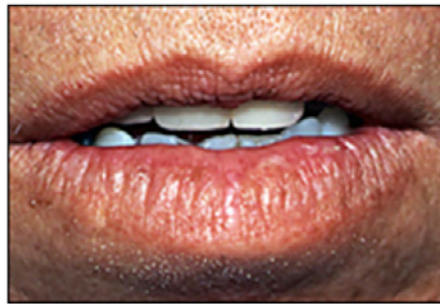
Figure 3. Solar cheilosis characterized by marked parallel folds and loss of elasticity.