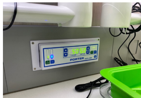
Figure 6. Oxygen: Nitrous oxide concentration for Rapid titration technique

into the atmosphere. If the patient expresses claustrophobia with placement of the nasal hood directly on the nose, administration is initiated with a 50% oxygen/50% nitrous oxide concentration prior to seating of the nasal hood (Figure 6). The nasal hood is positioned approximately three inches above the patient's nose. The nitrous oxide, being denser than air, will drop onto the patient's nose, the patient will inhale the gas, and hopefully, relax. As the patient relaxes, the nasal hood is brought closer to the nose until it is comfortably positioned on the patient's nose. The 50%/50% concentration is maintained for 2-3 minutes and then adjusted to 60% oxygen/40% nitrous oxide. The patient is asked to describe what they feel. As above, the concentrations and gas flow volume are adjusted until the patient feels comfortable and the reservoir bag is properly inflated.