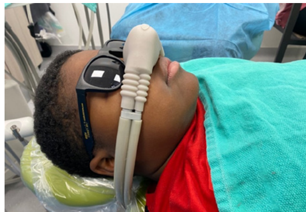
Figure 1. Nasal hood in correct position (side view)