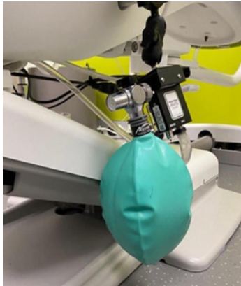
Figure 3. Overly inflated.