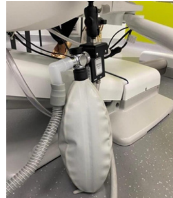
Figure 5. Correctly inflated.

This concentration remains at this level for three minutes. There should be minimal communication between the patient and dentist and/or auxiliary. Talking should be minimized so nasal breathing is maximized and the nitrous oxide/oxygen level remains constant during this period. At the end of three minutes, the dentist inquires of the patient what symptoms, if any, do they feel. Leading questions should be avoided, i.e., Do you feel tingling? Lightheaded? Relaxed? Asking such questions when the anxious patient is not feeling the effects of the nitrous oxide will just make the patient more anxious, for fear the gas is not working properly. The patient is asked to describe what they feel. If they respond there is no difference, the nitrous oxide/oxygen levels are adjusted to 30% nitrous oxide and 70% oxygen. The process is repeated and after three minutes the patient is once again asked to describe what they feel. If they respond in the negative, the nitrous oxide/oxygen concentration is increased to 40% nitrous oxide and 60% oxygen. This process may be repeated until the patient expresses positive symptoms. However, the concentration of nitrous oxide/oxygen may not exceed 70% nitrous oxide and 30% oxygen due to the fail-safe limitations set on the delivery unit.