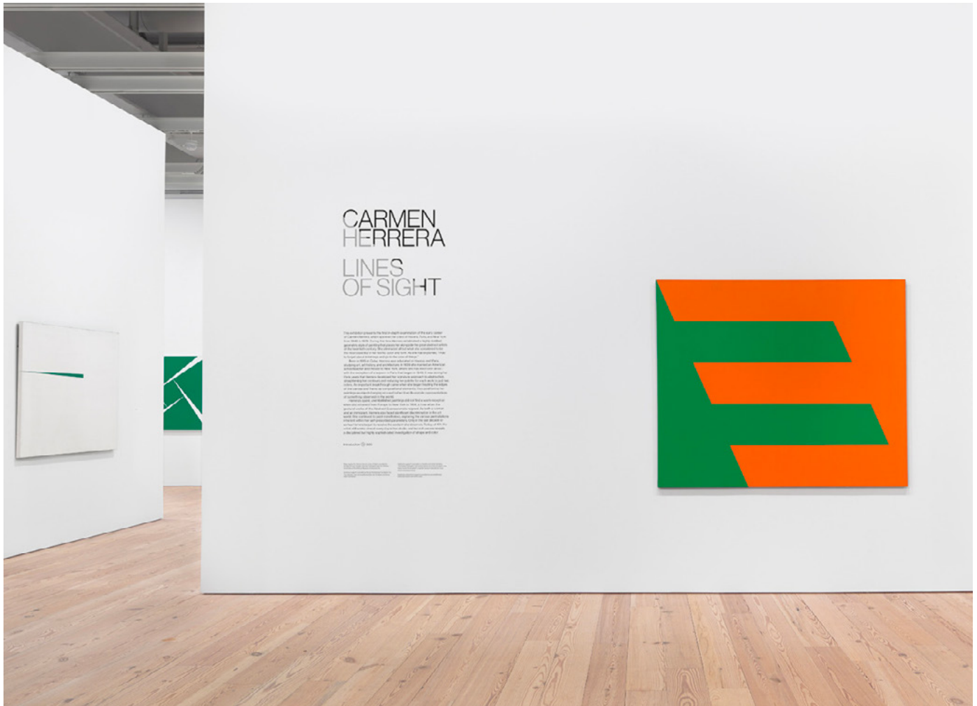
From Carmen Herrera's 'Lines of Sight' retrospective at the Whitney Museum of American Art, which exhibited September 16, 2016 through Jan 9, 2017.