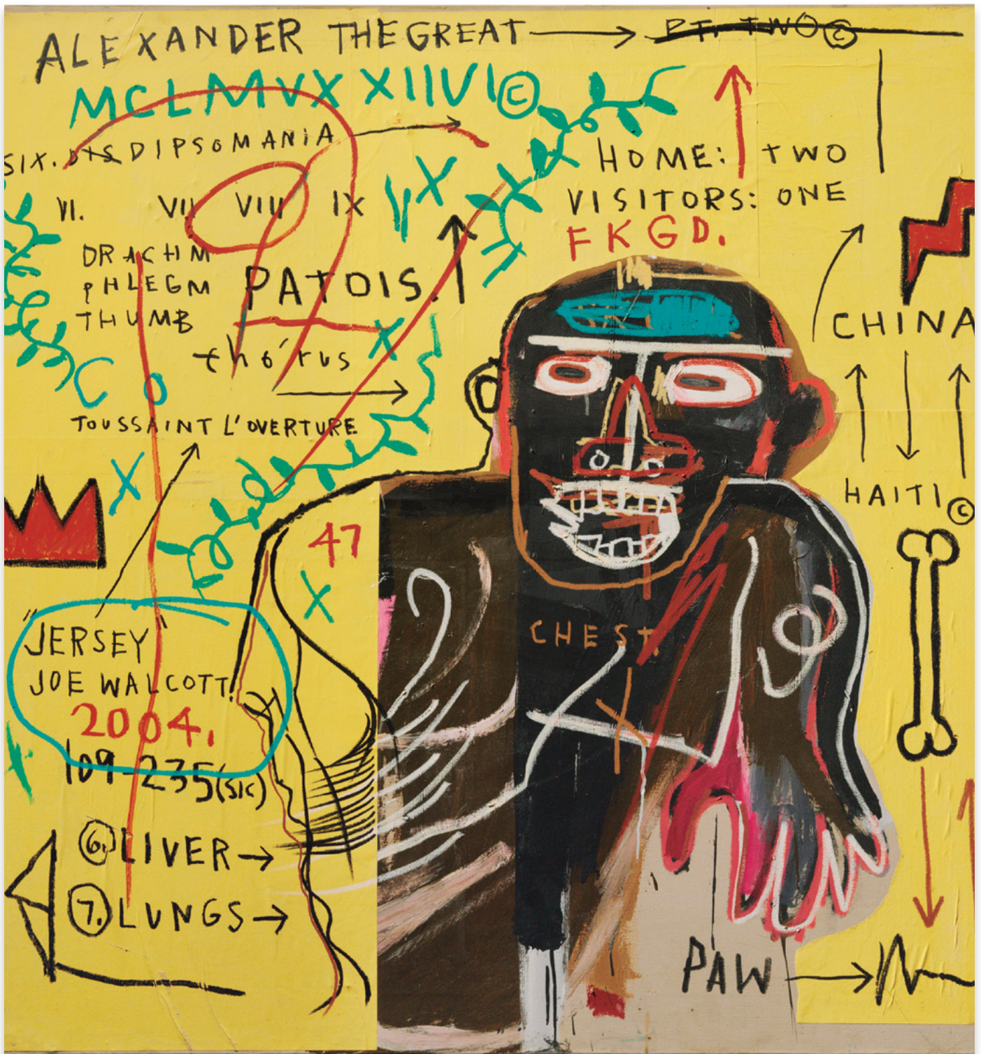
Signed, titled and dated Jean-Michel Basquiat All Colored Cast 1982 pt.2 (on the reverse)