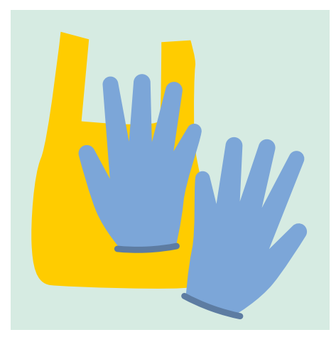
A glove or plastic bag over your hand.