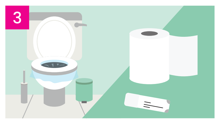
Collect your poo. Use one of the ideas on the other side of this leaflet to help you. Don't let your poo touch the water or toilet.