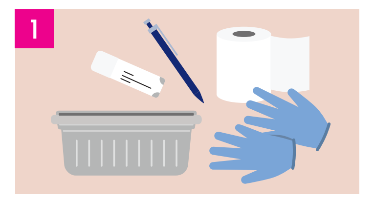
Get ready – make sure you have everything you need to collect your poo.