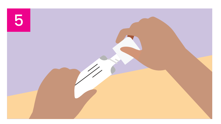
Put the stick back in the bottle and screw the cap to close it. Don't reopen the bottle after use. Wash your hands.