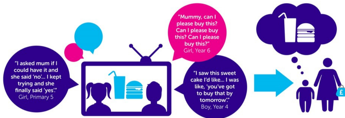
FIGURE 3: HFSS ADVERTISING ON TELEVISION CAN LEAD TO 'PESTER POWER'

While a number of studies have shown that the promotion of food products to children can influence their behaviour in a number of ways 9-12 qualitative accounts have been sparse. This study has not only helped fill such a gap by yielding rich in-depth data from the mini-group discussions but it has also shown that children's exposure to HFSS remains high in spite of the current restrictions. Due to time constraints, it was not always possible to explore all issues in