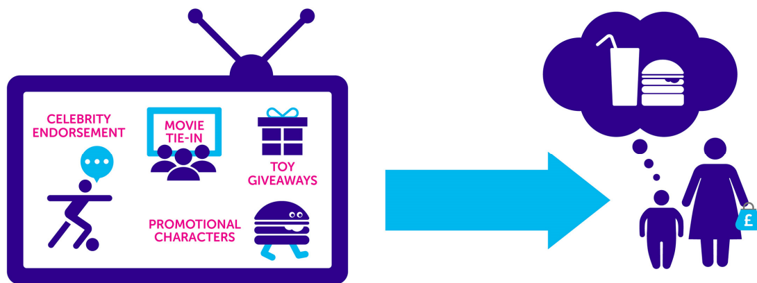
FIGURE 2: TACTICS USED TO PROMOTE FOOD PRODUCTS TO CHILDREN

In order to combat the rising impact of childhood obesity on the health of the nation, a multi-faceted approach is needed. There have been a number of reports reviewing the evidence for different policy interventions to address this problem 4, 6-8 . All of these conclude that childhood obesity is a complex, systemic issue that cannot be fixed by a 'silver bullet', but instead a wide-ranging programme is needed that incorporates food advertising and promotion, fiscal measures and product reformulation amongst other measures. In March 2016, the UK Government announced plans to bring in a soft beverages industry levy and is expected to publish their strategy for tackling childhood obesity later this summer (2016).