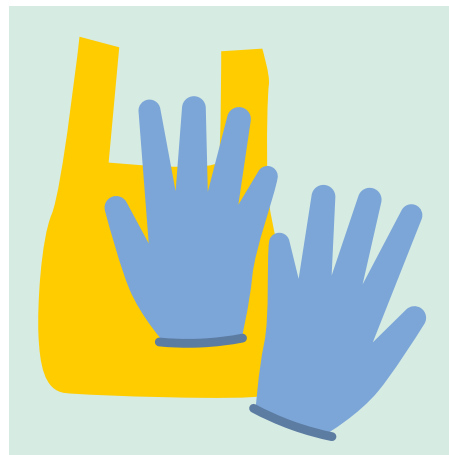
A glove or plastic bag over your hand.