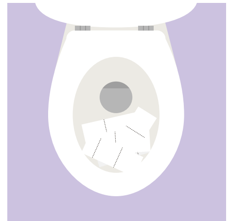
Layers of folded toilet paper in the toilet bowl.