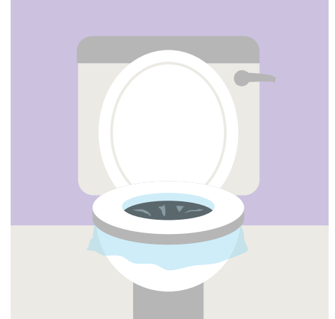
Cling film over the toilet (leave a dip).