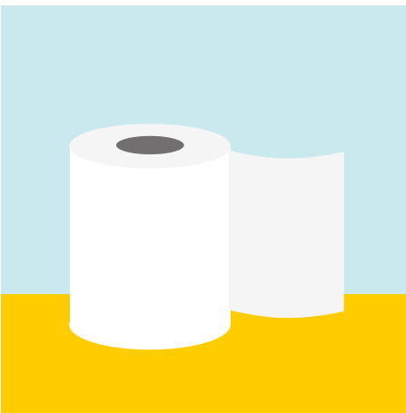
Folded toilet paper in your hand.