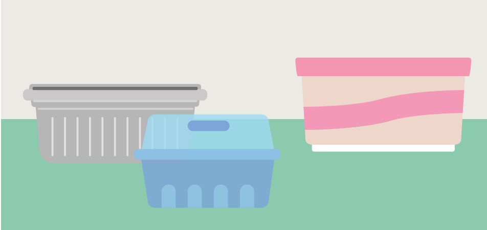
A clean, empty fruit carton, takeaway container, or ice cream tub.

Remember – don't let your poo touch the water or toilet.