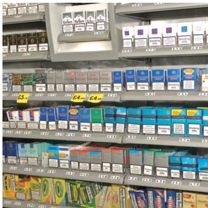
Tobacco 'powerwalls' have increased the visibility of cigarette packets.

This report covers two issues: Point of Sale (PoS) tobacco marketing and the promotion of tobacco accessories.