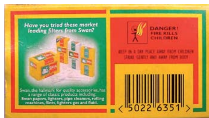
Figure E1: Back view of a Swan Safety Match packet

However as this advert on the back of a Swan matchbox clearly shows, the main use of these products is tobacco related.