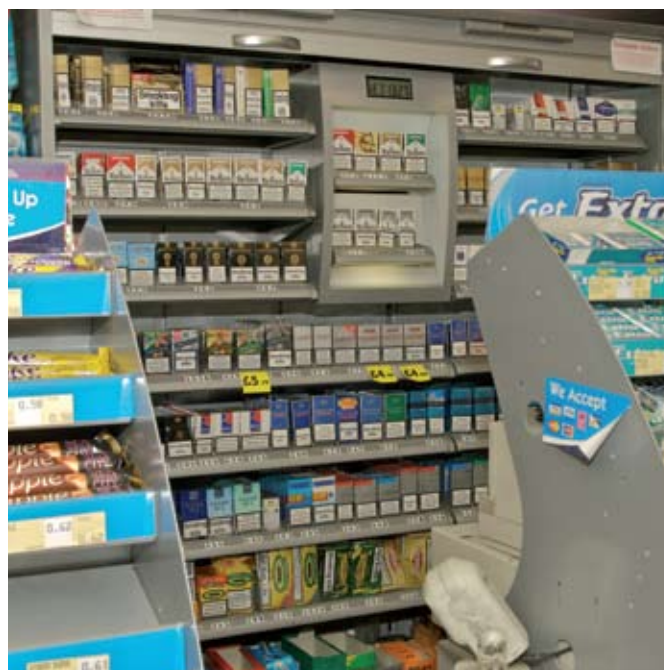
Tobacco products are often situated in close proximity to sweets and confectionary.

(7) It is highly effective. The power of PoS advertising to promote unplanned purchases is well documented; in relation to tobacco, Point of Purchase Advertising International (POPAI), the trade association for PoS marketers, has estimated that PoS promotion can boost sales of tobacco products by between 12% and 28% (Figures cited in Feighery et al 2001, p.184). An Australian study by Wakefield et al (2008) found that 25% of adult smokers purchased cigarettes