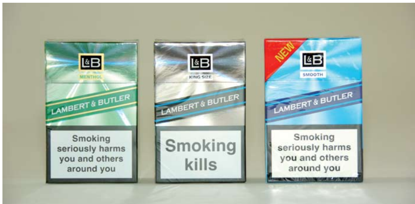
Lambert and Butler's new hologram-effect pack designs increase the impact of the brand on the shelf.

this very overtly through direct mail and loyalty schemes; now it is done more subtly through brand value, economy offerings and packaging, and PoS display is a key channel for communicating these encouragements.