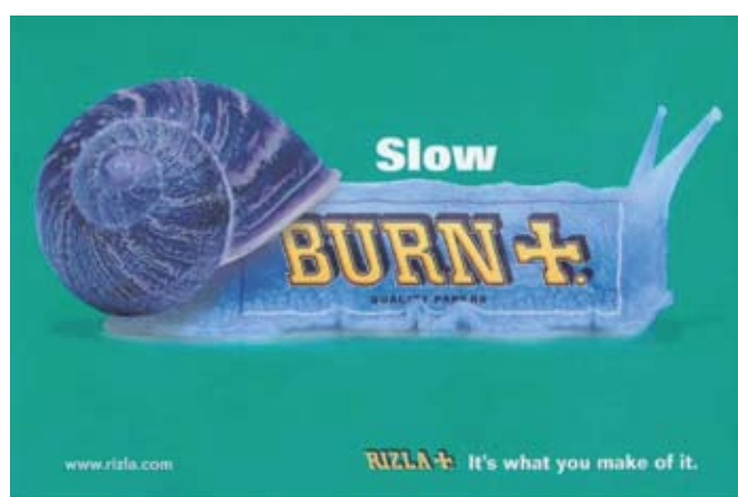
Figure E3: Rizla+ advert from 2008 campaign

Rizla+, by their own admission has targeted these advertisements to the roughly 2.8 million adults aged 18-34 years in the UK who roll their own cigarettes (ASA 2003). Insight into the advertising campaign strategy for Rizla+ is indicated by the super brands review;