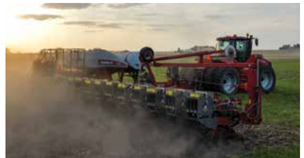
SIMPAS and SmartCartridge containers apply insecticides, fungicides, nematicides and micronutrients in one simple pass.

From Case IH ® to John Deere ® to Great Plains ® to Kinze ® to White ™ , SIMPAS application system equipment is designed to fit a wide variety of planter makes and models with easy-to-install planter-specific brackets. Accuracy, safety and versatility – make the smart move to the SIMPAS closed handling and application system.