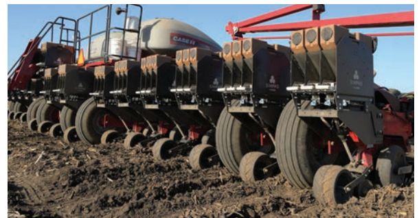
SIMPAS and SmartCartridge containers apply insecticides, soil health products, nematicides and micronutrients in one simple pass.

From Case IH® to John Deere® to Great Plains® to Kinze® to White™, the SIMPAS application system is designed to fit a wide variety of planter makes and models with easy-to-install planter-specific brackets. Accuracy, safety and versatility – make the smart move to SIMPAS.