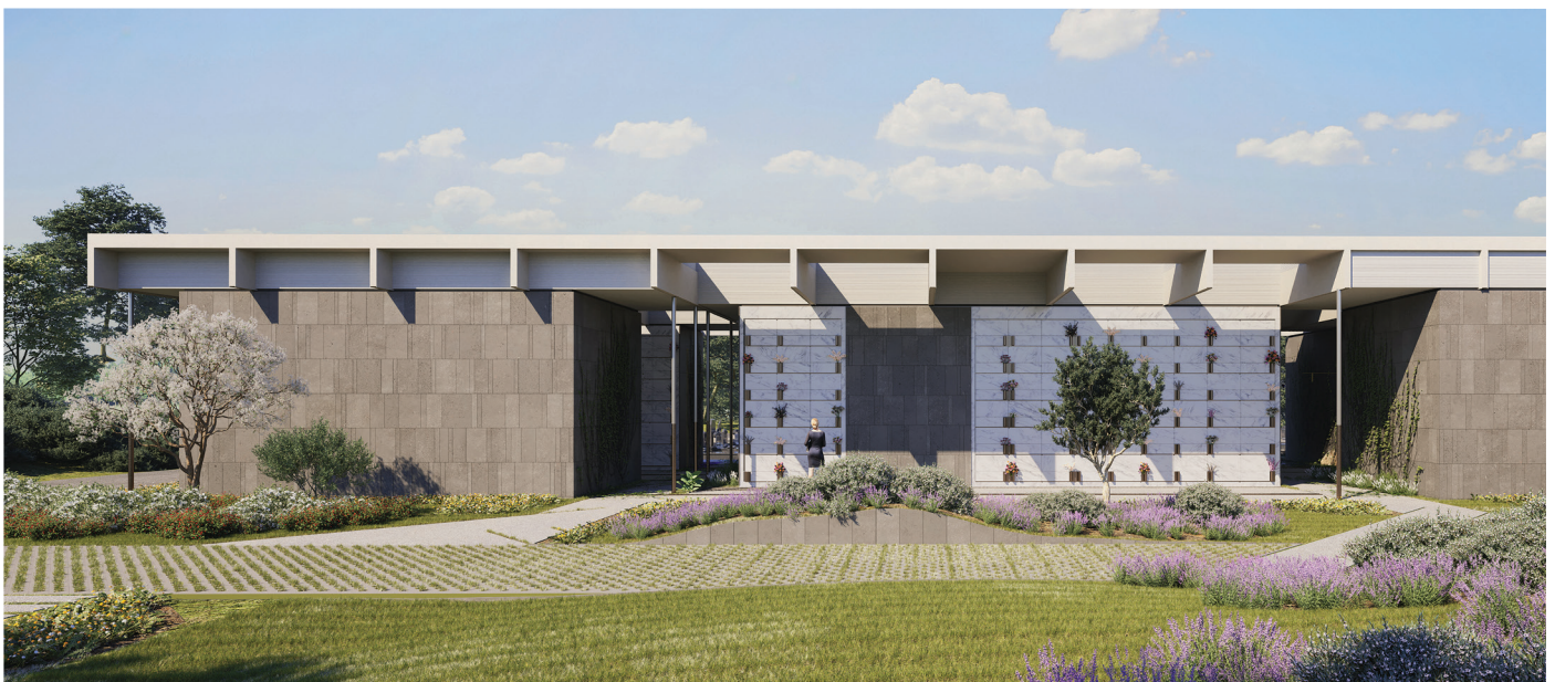
Render of the Gallery of the Saints Mausoleum

Mausoleum levels A and B are accessible to touch based on the average height of 1.7m. Level C may be accessible. Levels D – F are not accessible, and ladders are not provided or permitted. The cost of level D-F is reduced to reflect this limited accessibility.