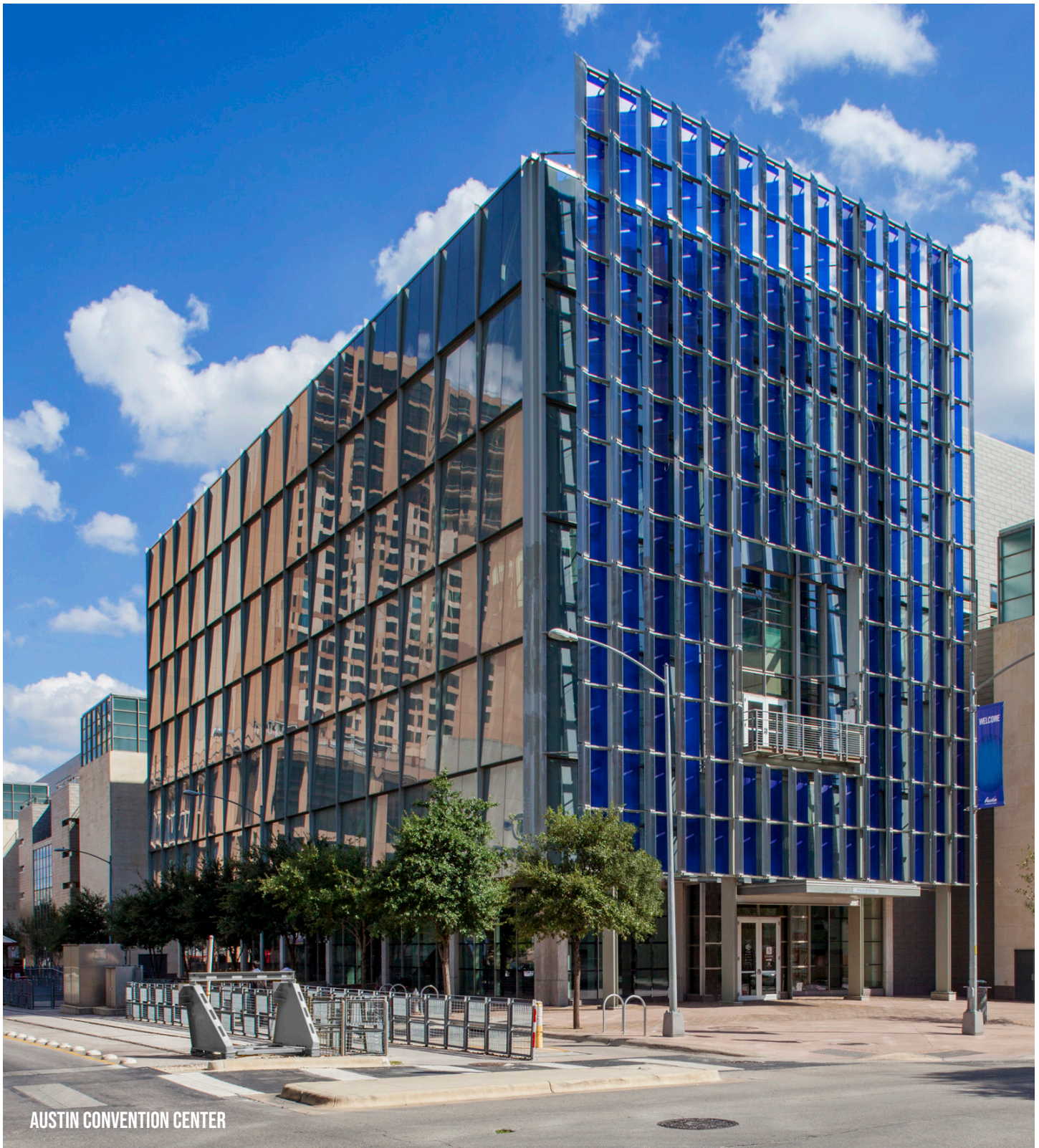
AUSTIN CONVENTION CENTER

“ THIS PLAN WAS COMMISSIONED TO SAFEGUARD THE HEALTH AND WELL-BEING OF OUR CLIENTS, THEIR EVENTS, OUR TEAM MEMBERS AND OUR LOCAL AUSTIN COMMUNITY. ”