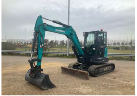
2022 Sunward SWE60UF