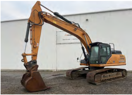
2015 CASE CX300C