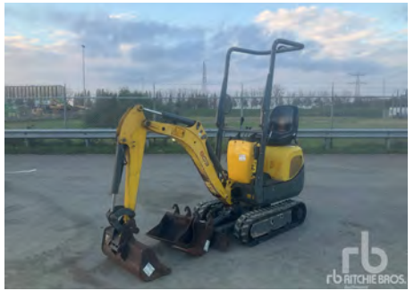
WACKER NEUSON 803