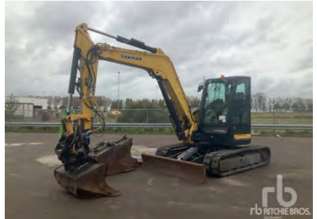
1/2- 2016YANMAR VIO80-1A