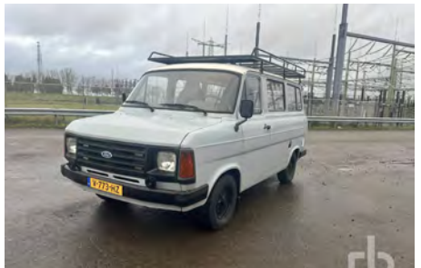
1985 FORD TRANSIT MK2 FT1 4x2 Old-timer