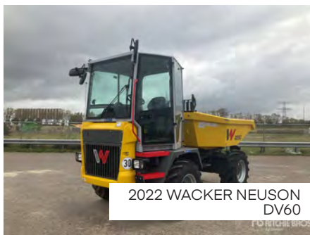
2022 WACKER NEUSON DV60