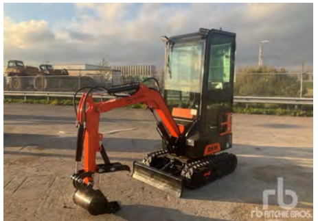
UNUSED - 2024 FF INDUSTRIAL QH-16