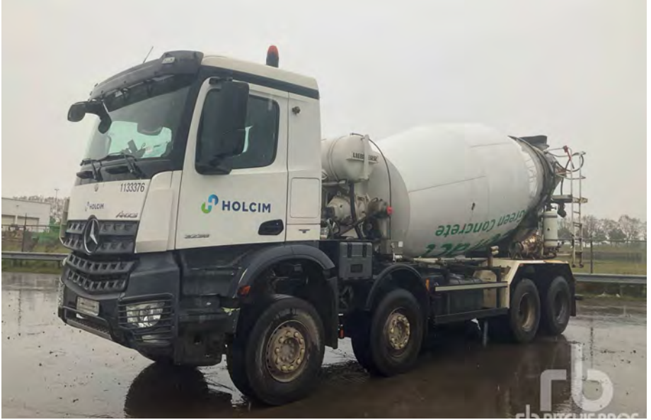
2014 MERCEDES-BENZ 3236 8x4 Twin-Steer