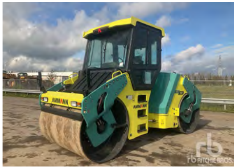
UNUSED - 2021AMMANN AV100X