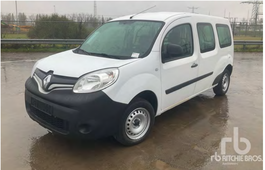
2020 RENAULT KANGOO 1.5DCI