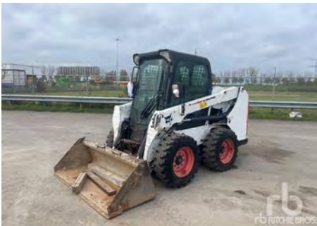
2014 BOBCAT S510