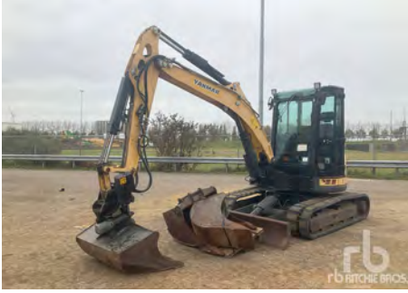
2016 YANMAR VI057-U