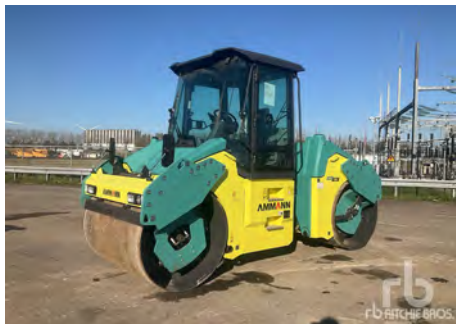
UNUSED - 2021AMMANN ARX90 T3