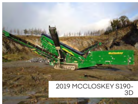
2019 MCCLOSKEY S190-3D