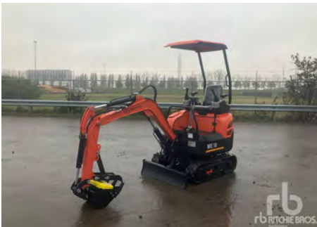
UNUSED - 2024 FF INDUSTRIAL ME18