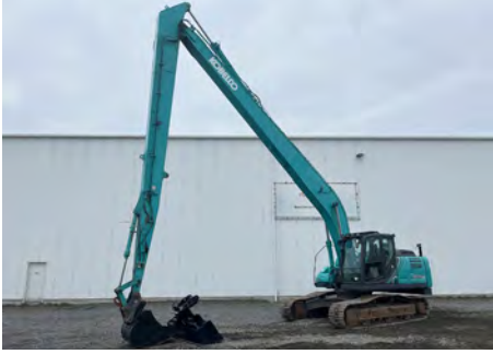
2017 KOBELCO SK260NLC-10