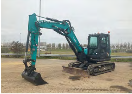
2022 Sunward SWE90UF