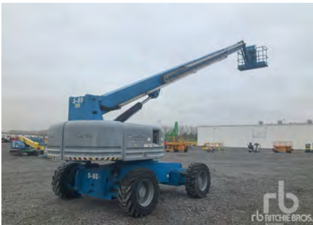
GENIE S85 Diesel