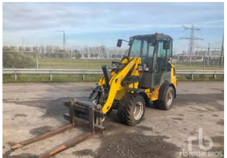
WACKER NEUSON WL30