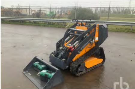
1/2 - UNUSED - 2024 PLUS POWER NMT60