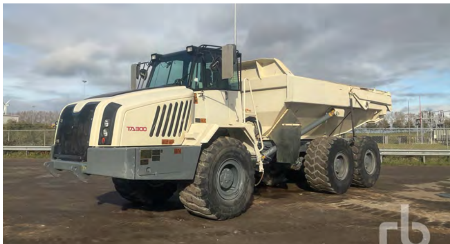
2016 TEREX TA300