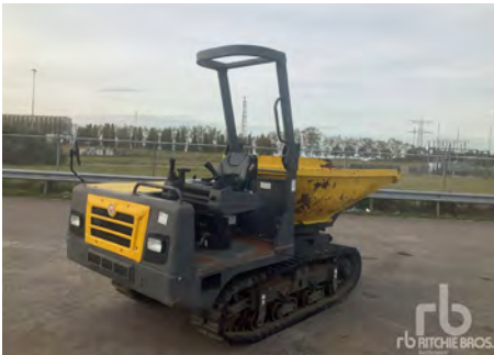
2015 WACKER DT25