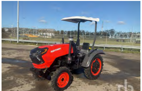
1/3 - UNUSED - 2024 PLUS POWER TT254