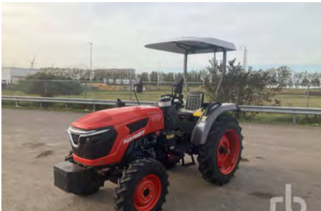
1/2 - UNUSED - 2024 PLUS POWER TT604