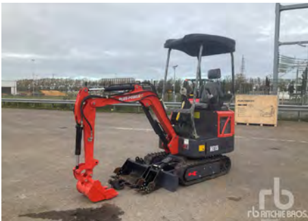
1/2 - UNUSED - 2023 PLUS POWER HE15