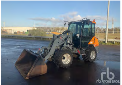
2016 GIANT V5003