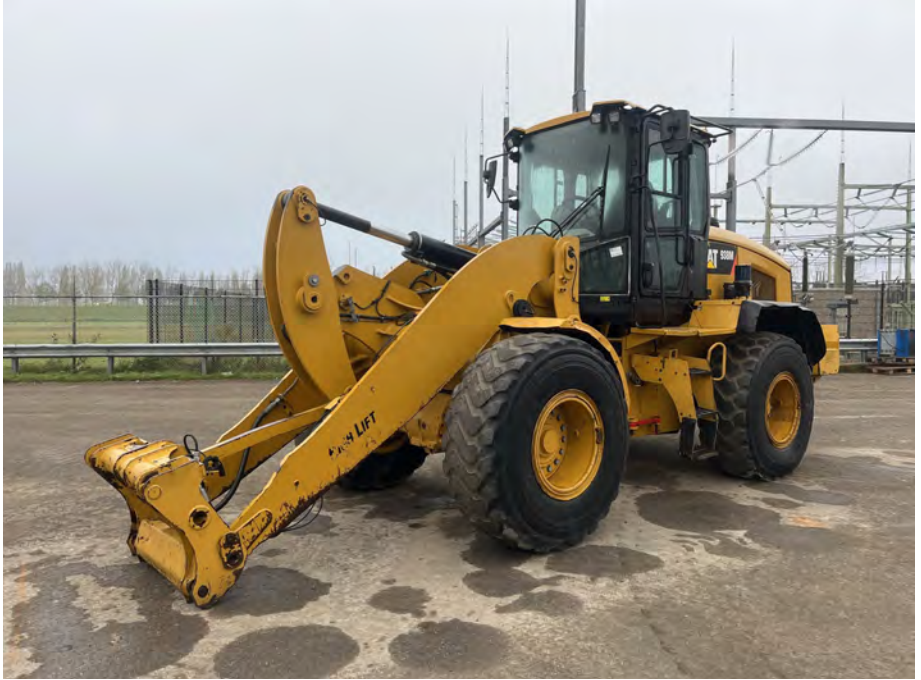
2015 CAT 938M Hi-Lift