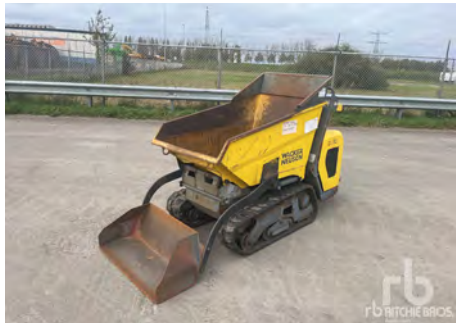
2015 WACKER NEUSON DT10