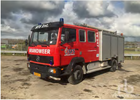
1987 MERCEDES-BENZ 1117 4x2