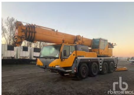
LIEBHERR LTM 1060/2 (Inopeable)