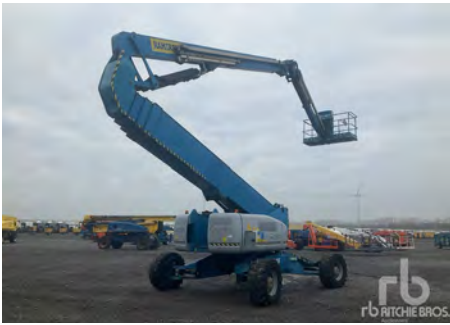
GENIE Z135 4WD Diesel