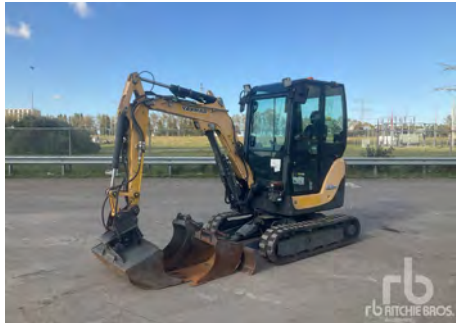
1/2 - 2016 YANMAR SV22