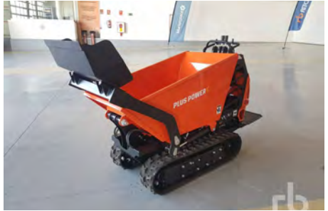
1/7 - UNUSED - 2024 PLUS POWER T50FL