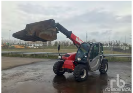
1/2 - 2015 MANITOU MT625