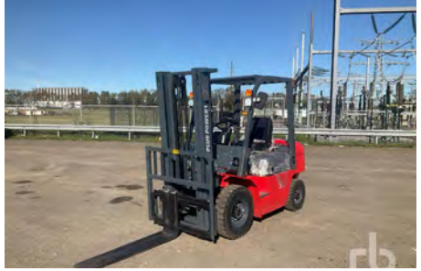
1/4 - UNUSED - 2024 PLUS POWER VTDD-25