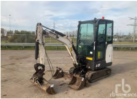
2015 BOBCAT E19