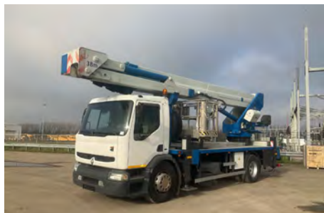
BIZZOCCHI KFJ380 on a Renault Premium 250