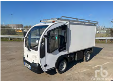
1/23 - 2015 GOUPIL G3