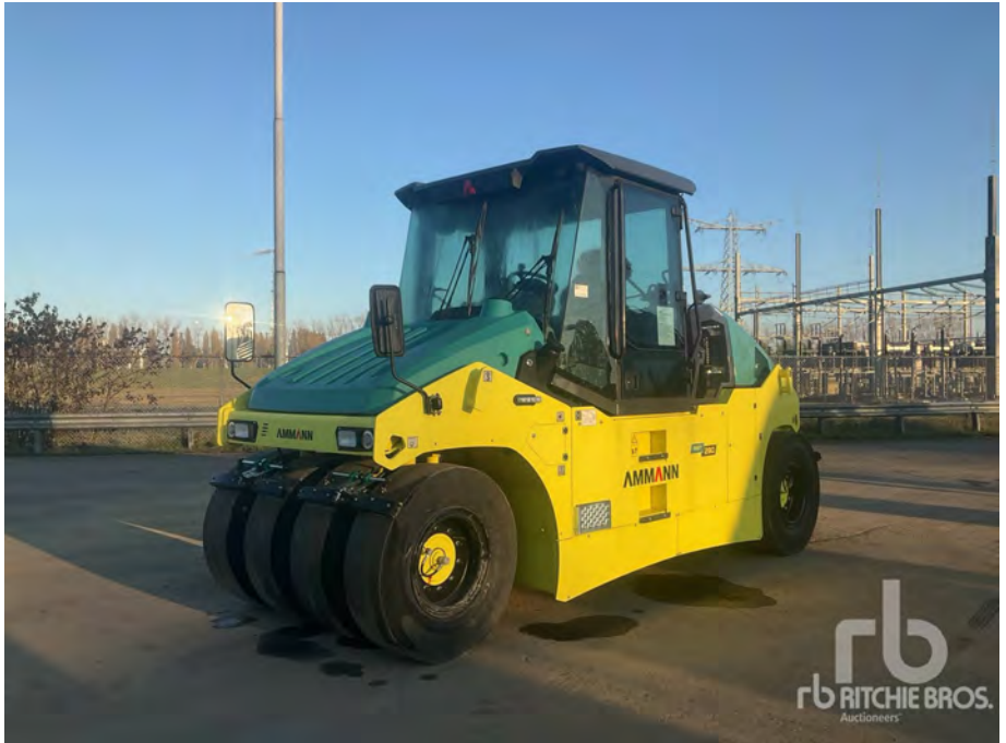
1/3 - UNUSED - 2023AMMANN ART 280 T3