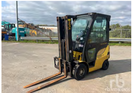
2015YALE GLP20SVX 1500 kg

Add value to your equipment have it cleaned, repaired and painted by the experts at Ritchie Bros.