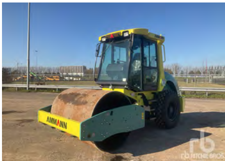
1/4 - UNUSED - 2024AMMANN ASC70 T3