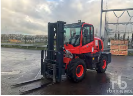
UNUSED - 2024 PLUS POWER T30A