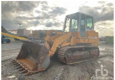
LIEBHERR LR622 (Inoperable)