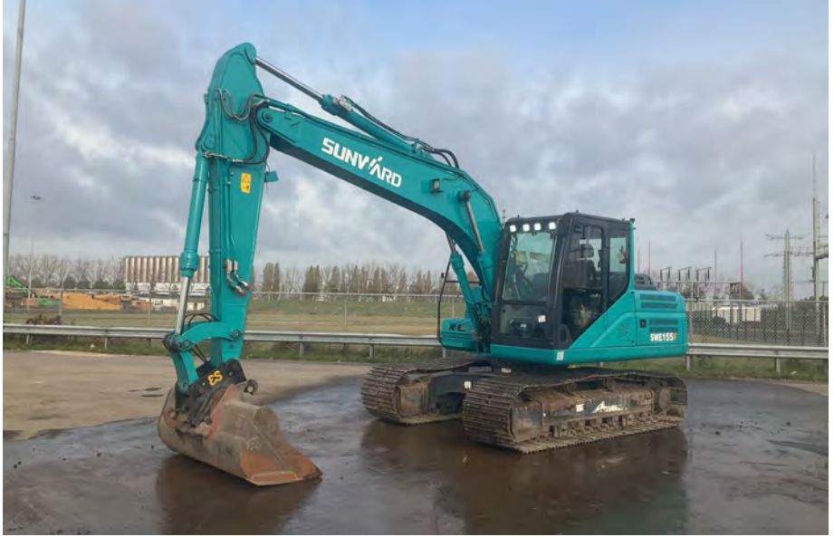
2021 Sunward SWE155F