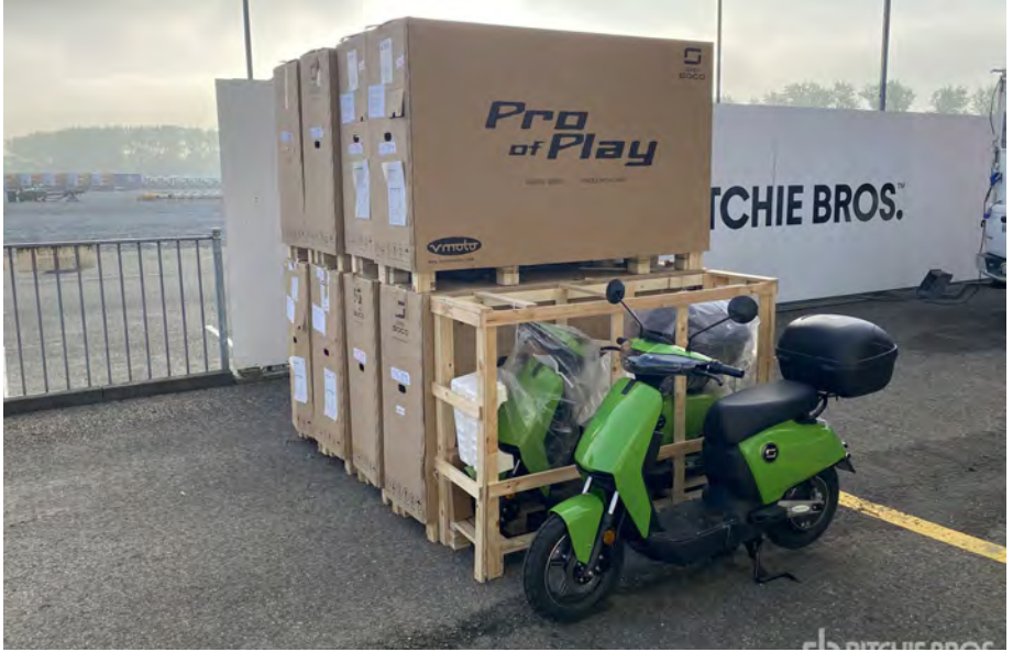
UNUSED - 2021VMOTO SCOOTERS