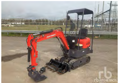
1/2 - UNUSED - 2023 PLUS POWER HE12