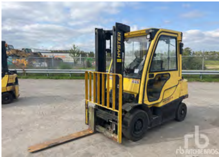
2018 HYSTER H2.5 FT 2470 kg