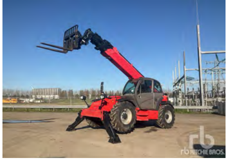
2014 MANITOU 1840MT