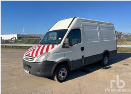
IVECO DAILY 35C13