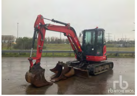
2015 KUBOTA U48-4