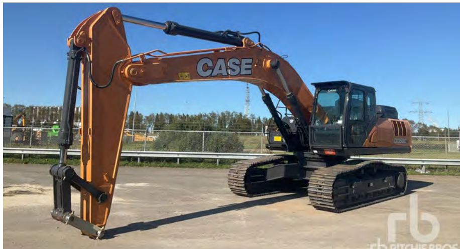
UNUSED - 2021 CASE CX350C-8