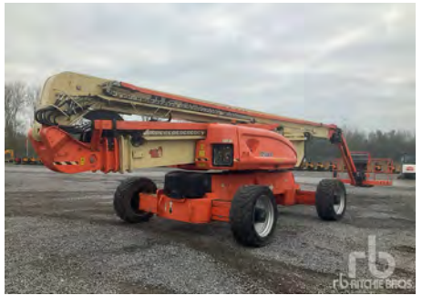
2014JLG 1250AJP 4WD Diesel