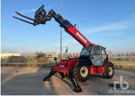
2019 MANITOU MT1840-100