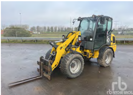
2014 WACKER NEUSON WL37