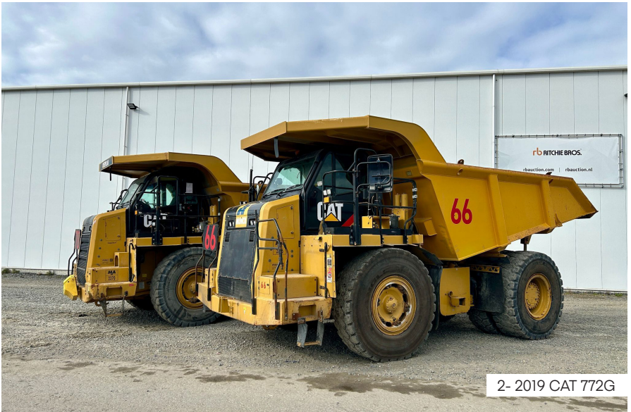
2- 2019 CAT 772G