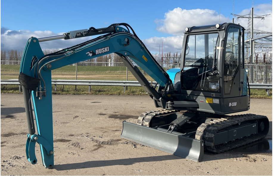
2021 HUSKI (TOYOTA) M55U (Unused)