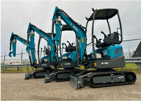
3/4- 2023 HUSKI M22U (Unused)