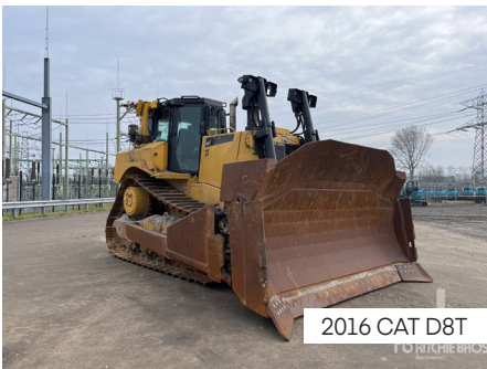
2016 CAT D8T