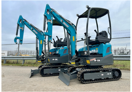
2- 2022 HUSKI M13K (Unused)