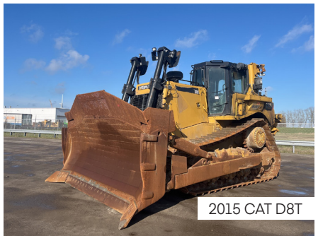
2015 CAT D8T