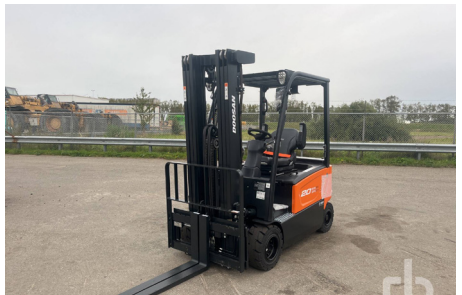
1/5- 2023 DOOSAN B20X-7 PLUS (Unused)