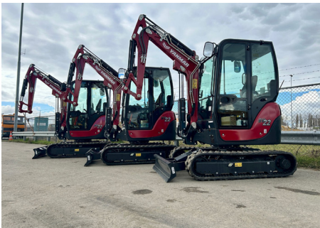
3/5- 2025 Yanmar SV22 (Unused)