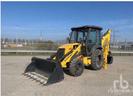
2018 NEW HOLLAND B80B