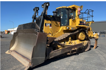
2006 Cat D9T