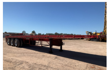
1 of 2 - 2007 Vawdrey