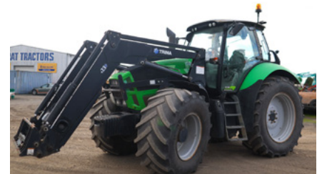
2013 Deutz-Fahr Agritron TTV630