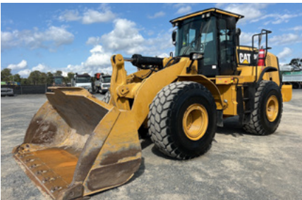
2014 Cat 966K