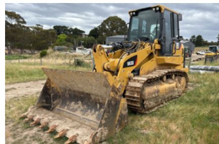
2013 Cat 963D