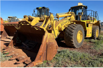
2011 Cat 988H