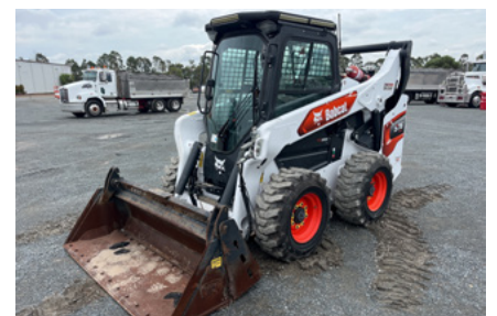
2021 Bobcat S76 Two-Speed