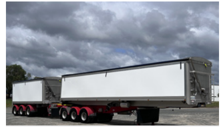
2021 Lusty EMS B-Double Combination