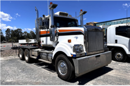
2009 Western Star 4900FX 6x4