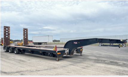
2009 VHLC 3 Rows of 8 Hyd Widening