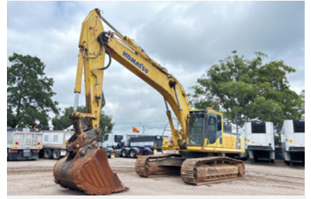
2013 Komatsu PC450LC-8