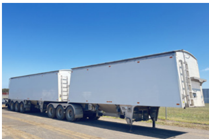
2 - 2017 Titan