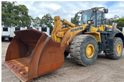
2018 Komatsu WA500-7