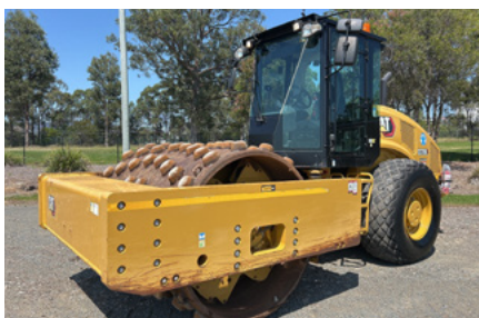
2021 Cat CS78b