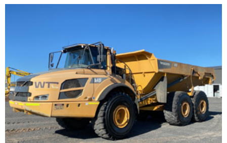
2011 Volvo A40F