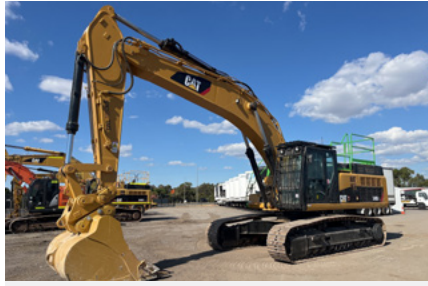
2012 Cat 349D L