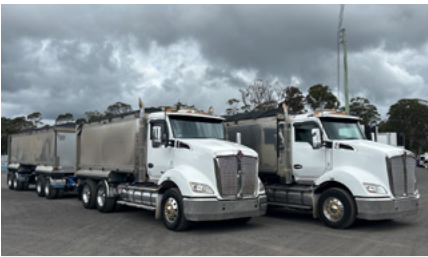
2018 & 2017 Kenworth T610 6x4, 2018 & 2017 Sloanebuilt