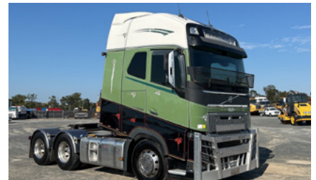
2019 Volvo FH16 Globetrotter 6x4