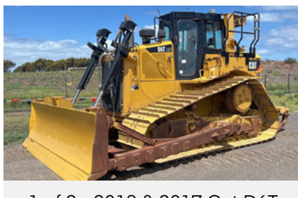
1 of 2 - 2018 & 2017 Cat D6T LGP