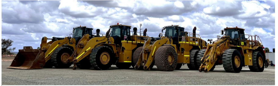
2019, 2018, 2014 Cat 988K & 1 - 2012 988H