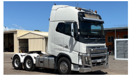
2014 Volvo FH16 Globetrotter 6x4