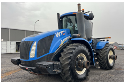
2014 New Holland T9.615