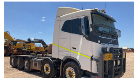
1 of 3 - 2016 Volvo FH16 10x6