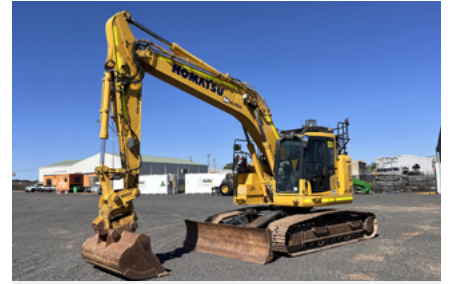
2020 Komatsu PC228USLC-11