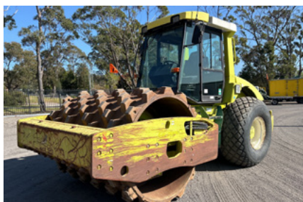
2012 Ammann ASC150D