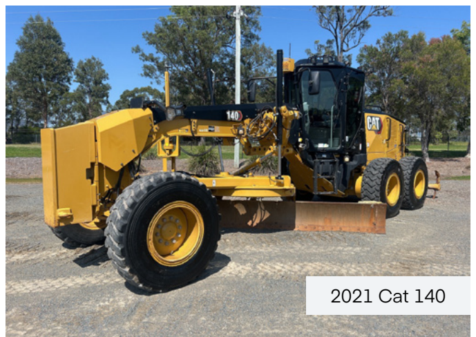
2021 Cat 140