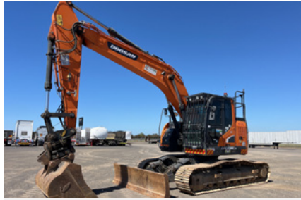
2020 Doosan DX235LCR-5