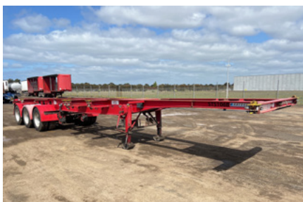
1 of 2 - 2011 Krueger