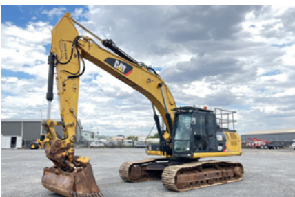
2013 Cat 329D L