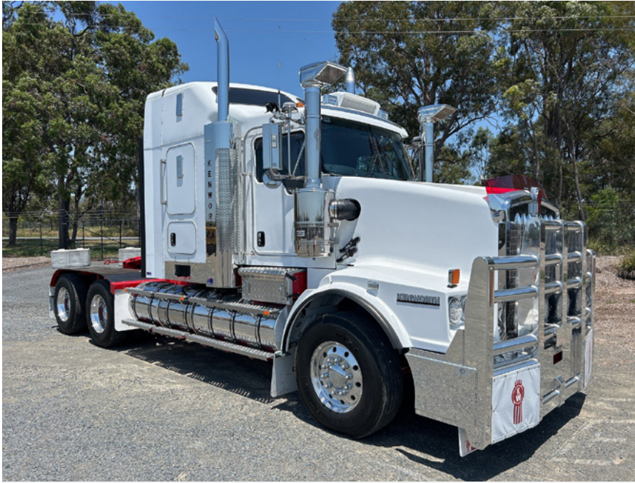
UNUSED - 2024 Kenworth T659 6x4