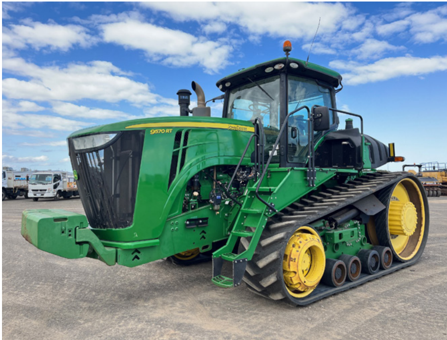
2017 John Deere 9570RT