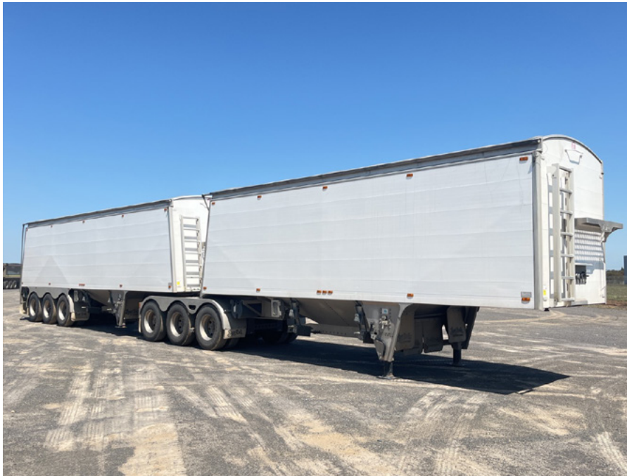
2 - 2021 Bruce Rock