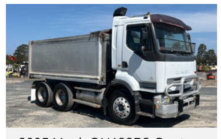
2005 Mack QH688RS Quantum 6x4