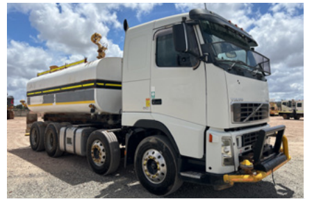
2005 Volvo FH16 18000 L 8x4