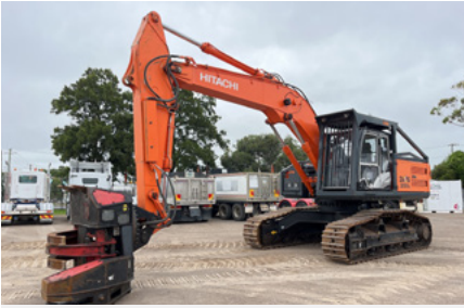
2017 Hitachi ZX250L-5G