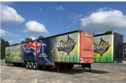
4 - 2012 Vawdrey