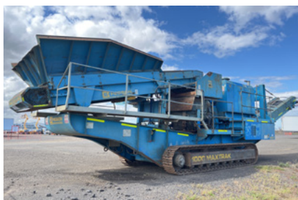
2002 Pegson AX 857 Maxtrak