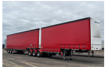
2 - 2017 Vawdrey