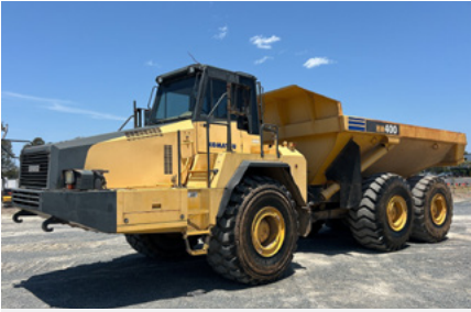
2007 Komatsu HM400-2