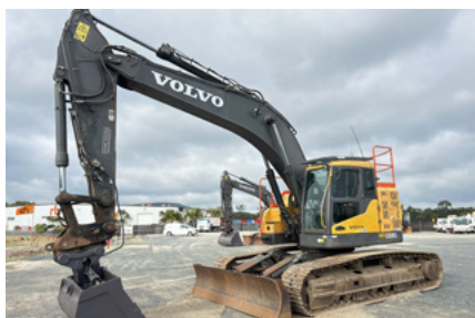
2019 Volvo ECR305CL