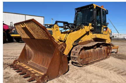
2017 Cat 963K