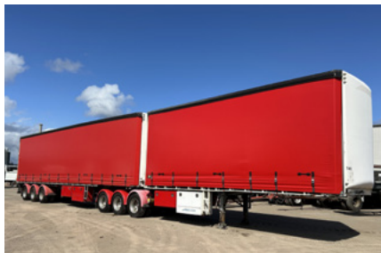
2007 & 2003 MaxiTrans