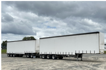
2 - 2017 & 1 - 2016 MaxiTrans