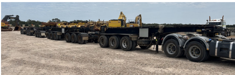
1 of 2 - 2009 CIMC Road Train Combination