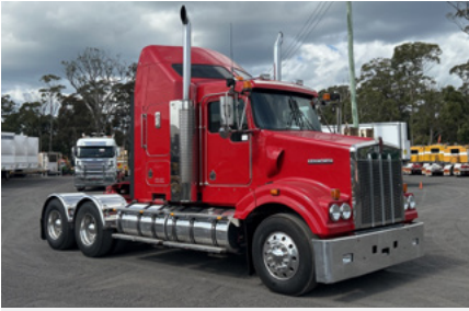
2008 Kenworth T408SAR 6x4