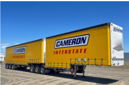
2 - 2019 Vawdrey