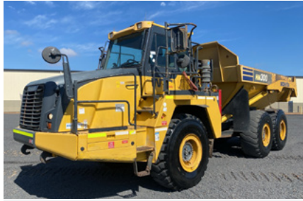
2019 Komatsu HM300