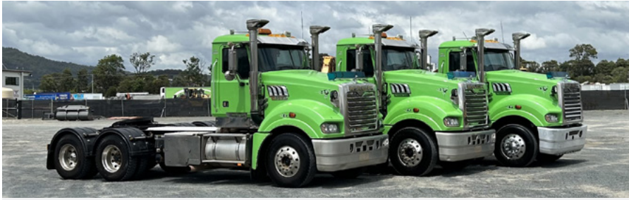
3 of 4 - 2019 Mack CLXT Super-Liner 6x4