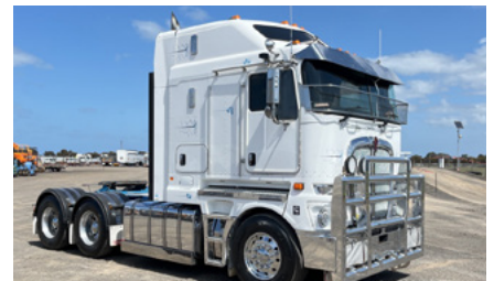
2018 Kenworth K200 Big Cab Aerodyne 6x4