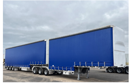
2 - 2023 Freightmore