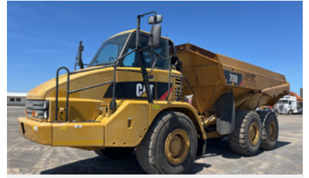
1 of 6 - 2008, 2006 & 2003 Cat 730