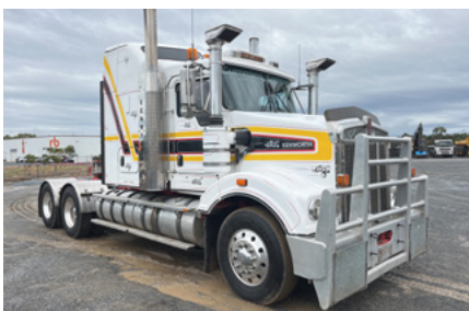
2012 Kenworth T409SAR 6x4