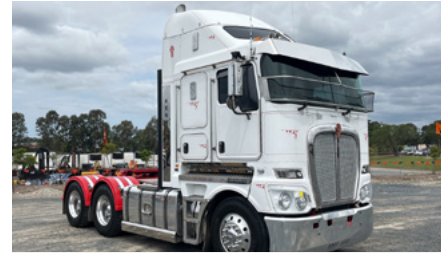
2021 Kenworth K200 Aerodyne 6x4