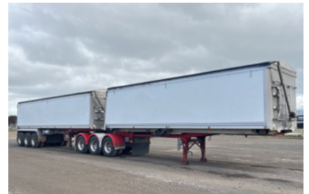
2 - 2017 Lusty EMS