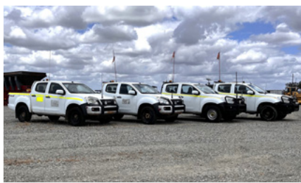
3 - 2019 & 1 - 2016 Isuzu D-Max 4x4