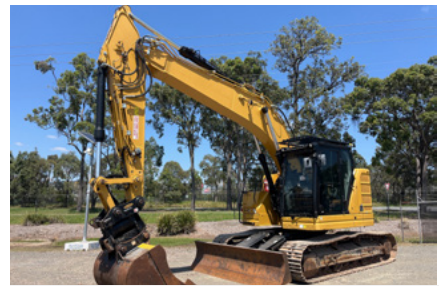
2020 Cat 325 Next Gen