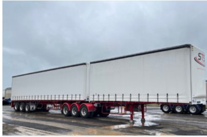
2 - 2023 MaxiTrans