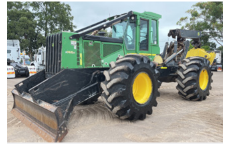
2008 John Deere 748H