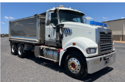
2012 Mack CMHR Trident 6x4