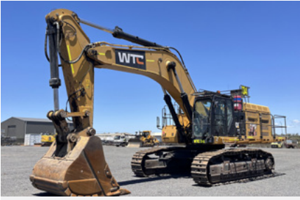
2015 Cat 374FLME