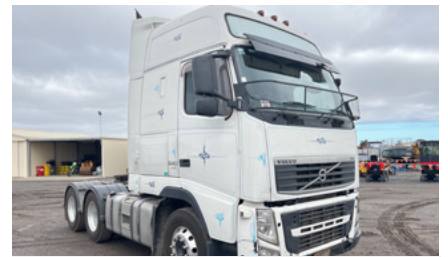
2012 Volvo FH13 Globetrotter 6x4