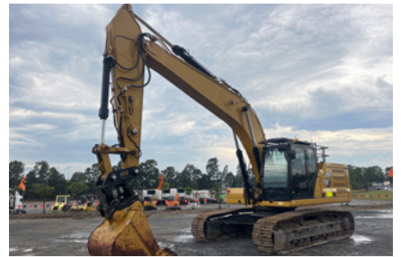
2022 Cat 330GC