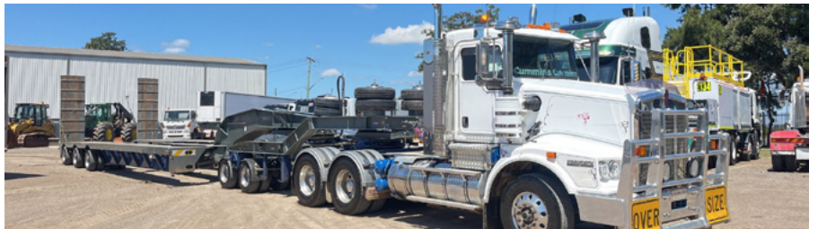
2014 Kenworth T659 6x4, 2009 Drake 2 Rows of 8 Hyd Widening & 2004 Drake 3 Rows Of 8 Hyd Widening