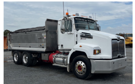
2014 Western Star 4700 6x4