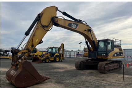
2007 Cat 330D