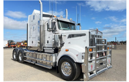
2015 Kenworth T909 6x4