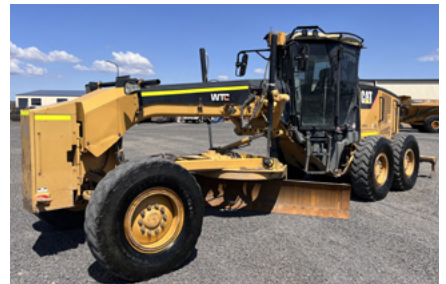
2010 Cat 12M VHP Plus