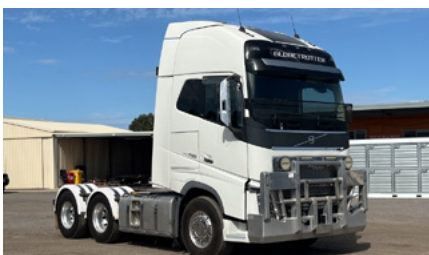
2018 Volvo FH16 Globetrotter 6x4