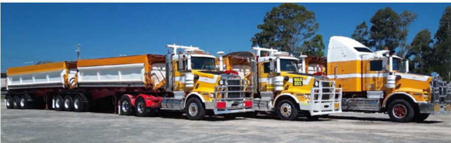
3 - 2011 Kenworth T659 6x4 & 9 - 2011 Azmeb