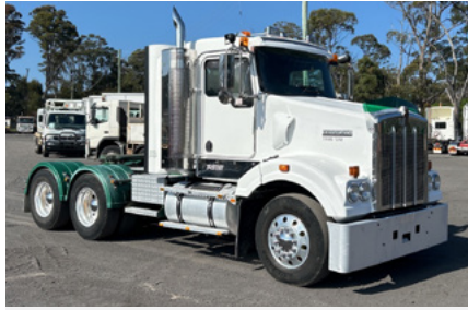
2009 Kenworth T408 SAR 6x4