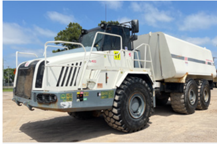
2011 Terex TA400 30000 L