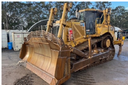
2005 Cat D8T