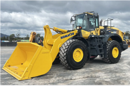
2016 Komatsu WA500-8