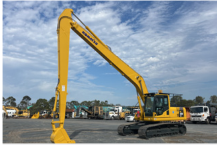
2013 Komatsu PC20LC-8NI