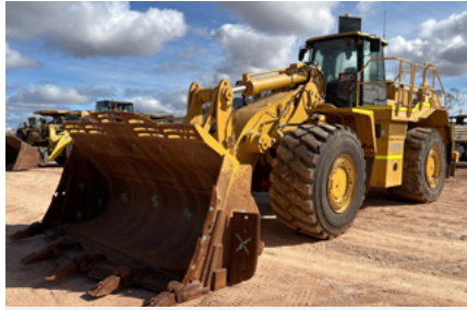
2010 Cat 988H