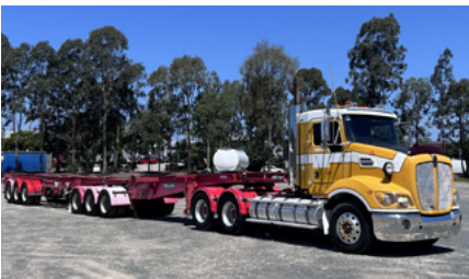
2012 Kenworth T403 6x4, 2012 Haulmark & 2012 MaxiTrans