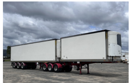
2 of 8 - 2013 & 2012 MaxiTrans