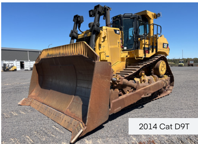
2014 Cat D9T