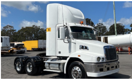
1 of 2 - 2015 Freightliner CST112 6x4