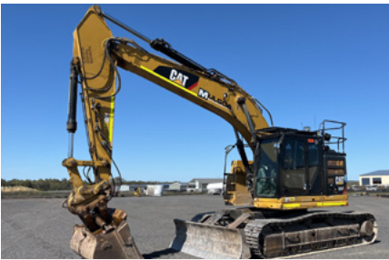
2018 Cat 335F LCR