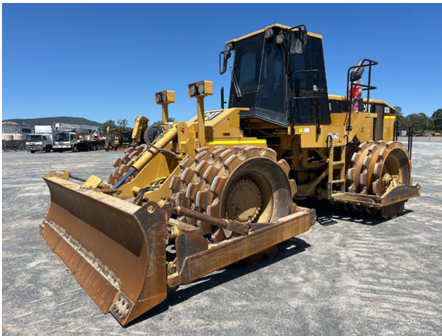
2003 Cat 825G II