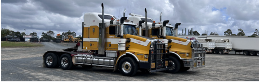
2 - 2018 Kenworth T659 6x4