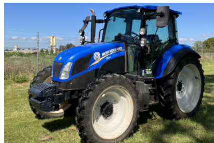
2018 New Holland T5.85