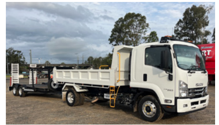
2021 Isuzu FSR 140 260 4x2 & 2021 Belco Trailers