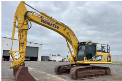
2017 Komatsu HM335LC-1