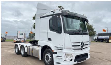
2020 Mercedes-Benz Actros 2645 6x4