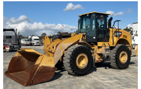
2019 Cat 950GC