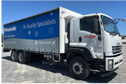
2019 Isuzu FXL 240 350 6x2