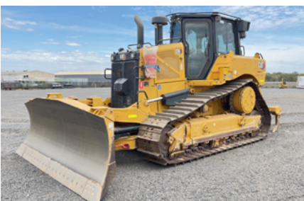
2021 Cat D6 Next Gen