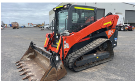
2021 Kubota SVL97-2 Two-Speed High Flow