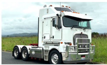
2012 Kenworth K200 Aerodyne 6x4