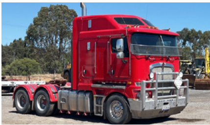
2014 Kenworth K200 Big Cab Aerodyne 6x4