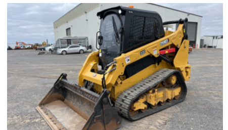
2022 Cat 259D3 Two-Speed High Flow