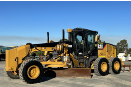
2018 Cat 140M VHP Plus