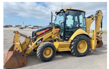
2010 Cat 432E Premier