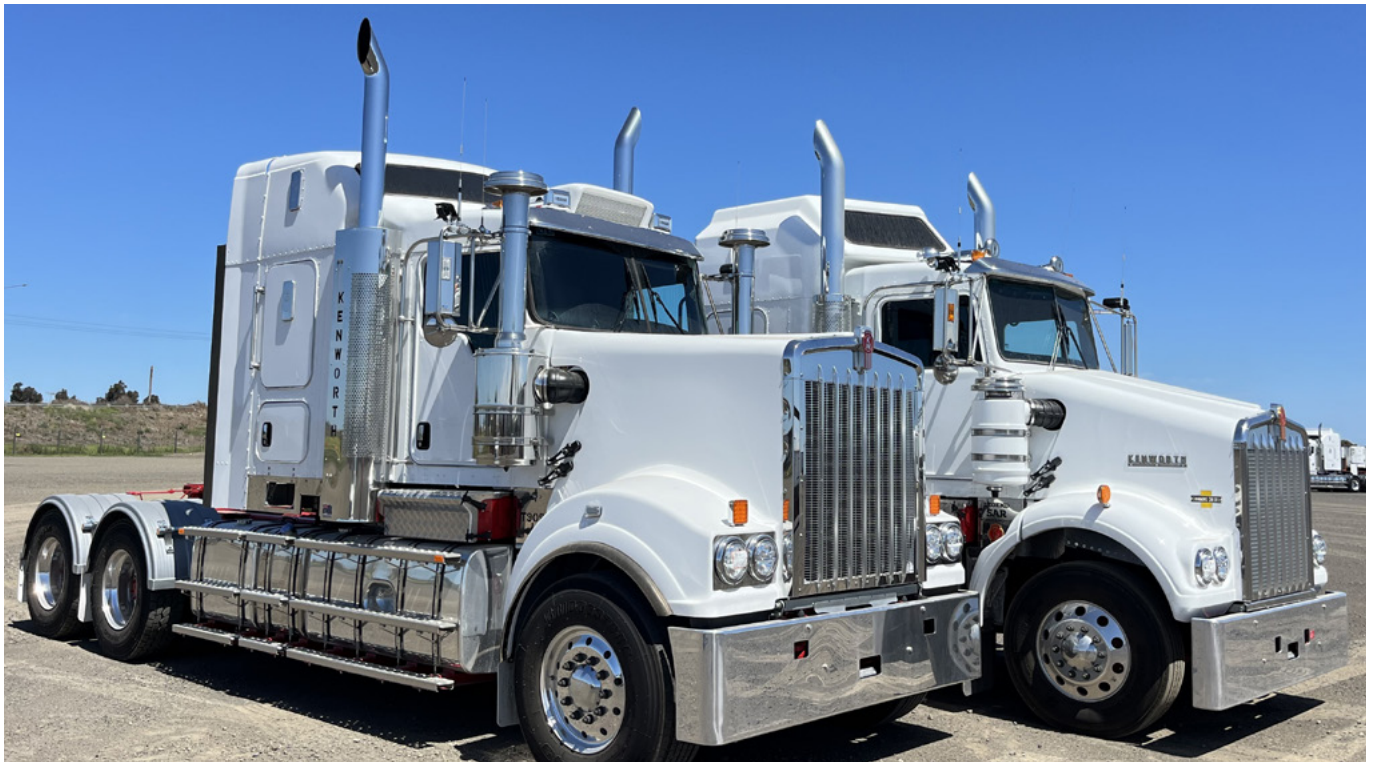
UNUSED - 2024 Kenworth W900SAR Legend 6x4 & 2024 Kenworth T909 6x4