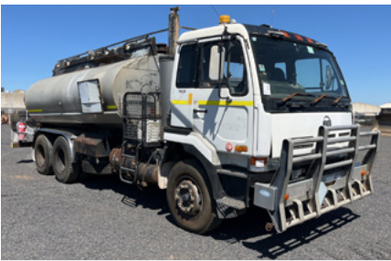
1993 Nissan UD CWB450 6x4