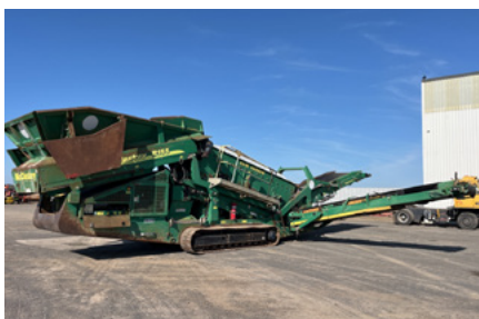
2012 McCloskey R155