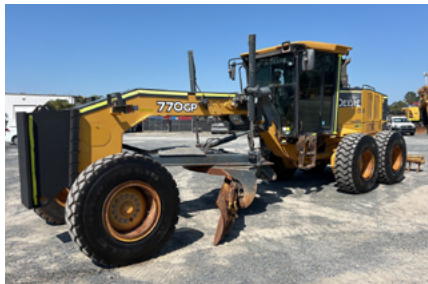
2012 John Deere 770GP