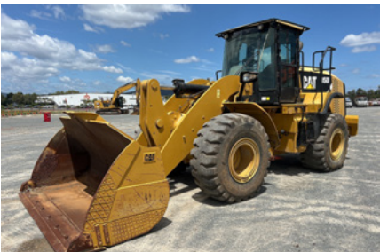
2013 Cat 950K