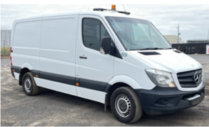
2014 Mercedes-Benz Sprinter 319 CDI 4x2