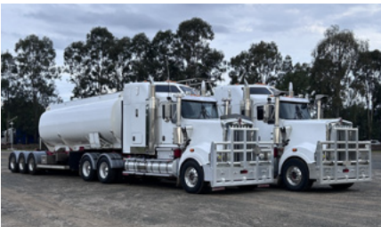
2 - 2019 Kenworth T909 6x4 & 2 - 2019 ATE