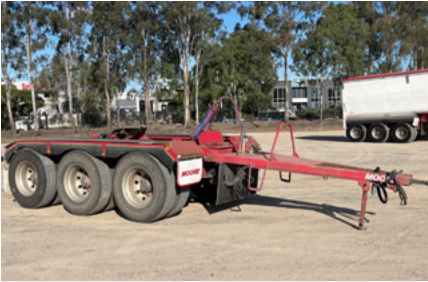
1 of 2 - 2018 Moore