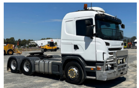
2012 Scania G440 6x4