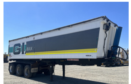
1 of 2 - 2010 Roadwest