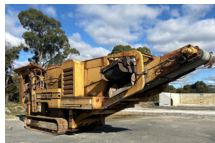
2006 Extec C10