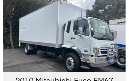
2010 Mitsubishi Fuso FM67 Fighter 4x2