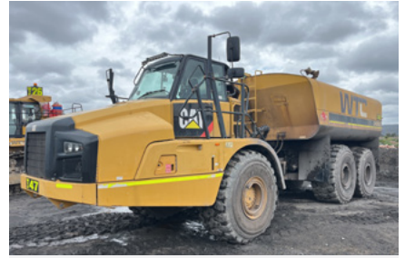
2012 Cat 740B 8000 L