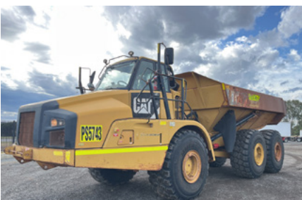
2012 Cat 740B