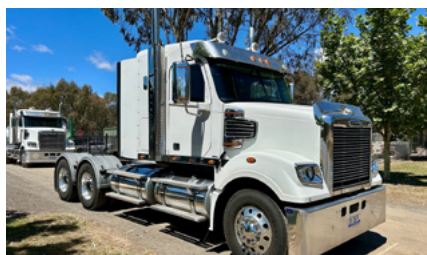
1 of 2 - 2017 & 2015 Freightliner Coronado 6x4