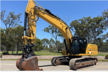
2022 Cat 340 Next Gen