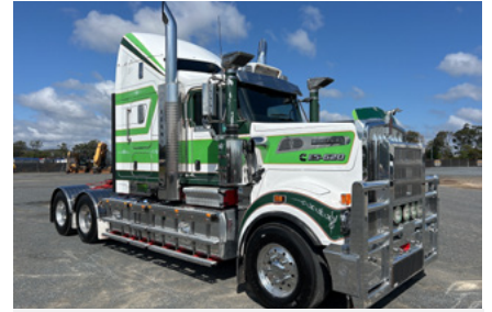
2016 Kenworth T909 6x4