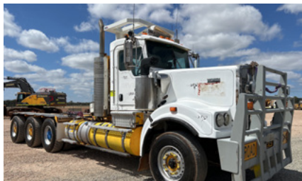
1 of 4 - 2022 & 3 - 2013 Kenworth C509 8x6