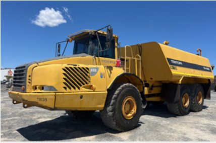
2004 Volvo A35D 32000 L