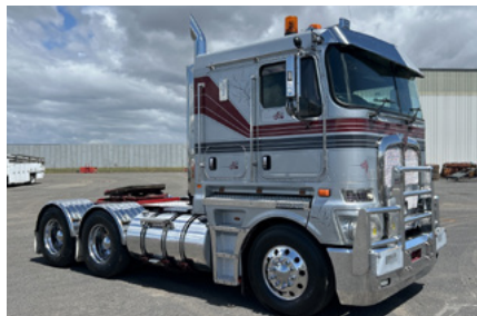
2013 Kenworth K200 6x4