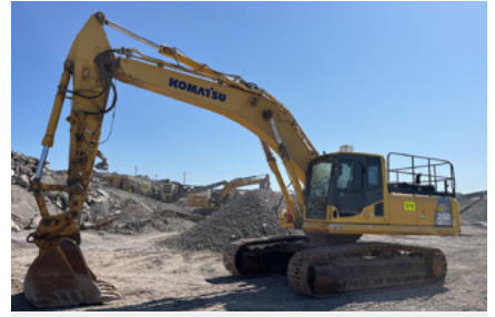
2011 Komatsu PC350LC-8