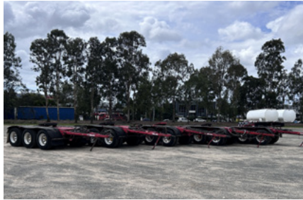
5 - 2011 Azmeb