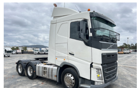
2017 Volvo FH13 6x4