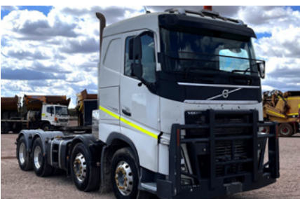
2017 Volvo FM13 8x4