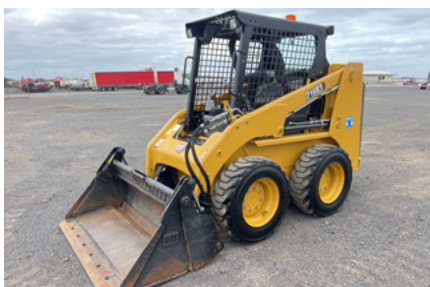
2021 Cat 216B3 Two-Speed