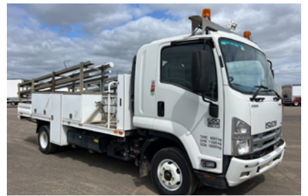
2015 Isuzu FRR 600 4x2