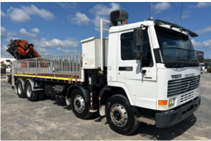
1998 Volvo FL10 8x4