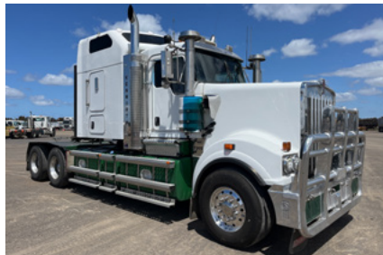
2019 Kenworth T909 6x4