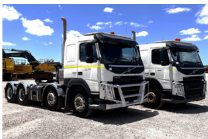
2 of 5 - 2016 Volvo FM13 8x4