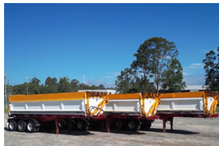
3 of 10 - 2011 Azmeb