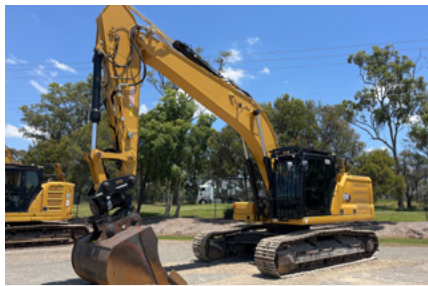
2021 Cat 330 Next Gen