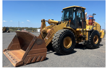
2008 Cat 972H