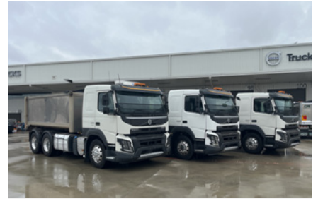
3 - 2020 Volvo FMX 500 6x4