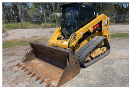
2021 Cat 279D3