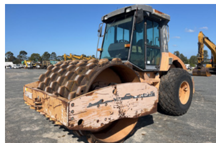
2001 Case SV212