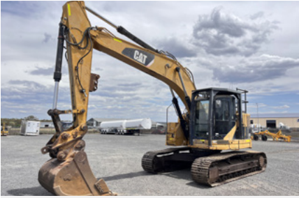
2008 Cat 321D LCR