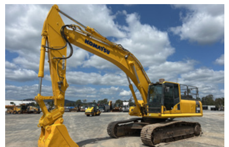
2012 Komatsu PC300LC-8