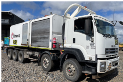
2013 Isuzu FYH 2500 10x4