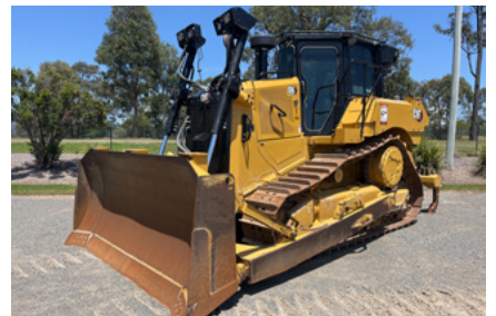
2022 Cat D6 Next Gen