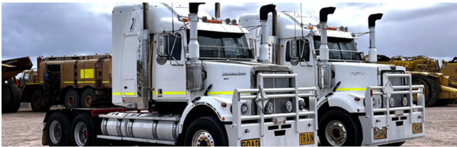
2 - 2018 Western Star 4800FXB 6x4