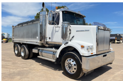
2010 Western Star 4800FX 6x4