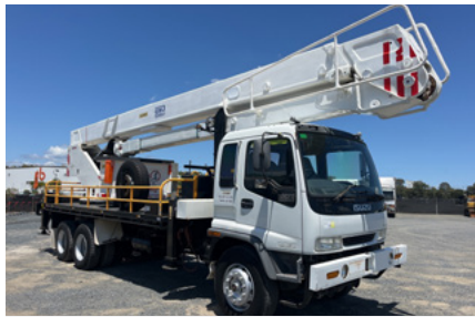
1999 Isuzu FVZ 1400 6x4