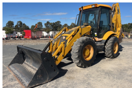
2005 JCB 214S 4x4x4