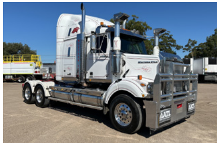
2014 Western Star 4800FX 6x4