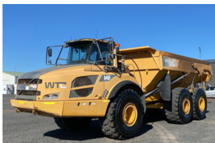
2012 Volvo A40F