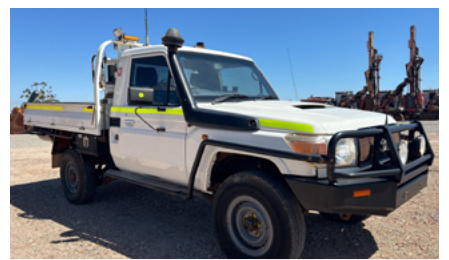
1 of 3 - 2010 Toyota LandCruiser 79 Series 4x4