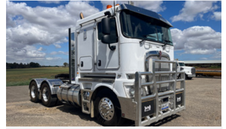
2022 Kenworth K200 Big Cab 6x4