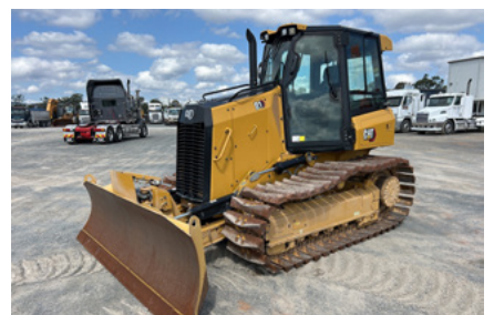
2021 Cat D1 LGP