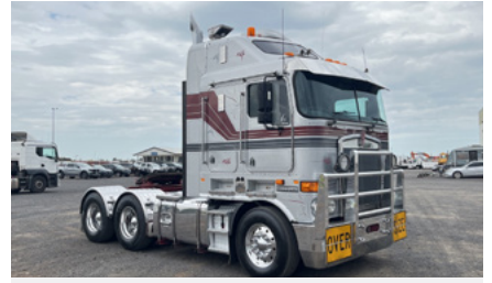
2009 Kenworth K108 Aerodyne 6x4