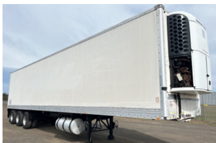
1 of 4 - 2010 Vawdrey