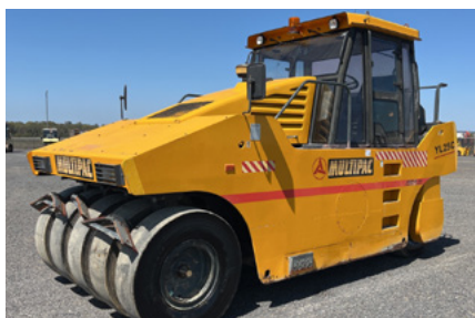
2009 Multipac YL25C