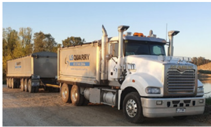
2018 Mack Super-Liner 6x4 & 2018 Hercules