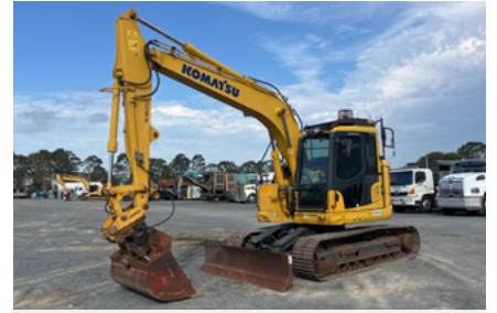
2018 Komatsu PC 138US-11