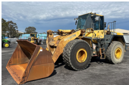
2011 Komatsu WA480-6A