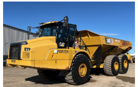
2017 Cat 745