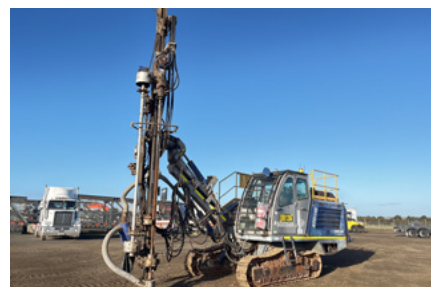
2012 Soosan STD14E