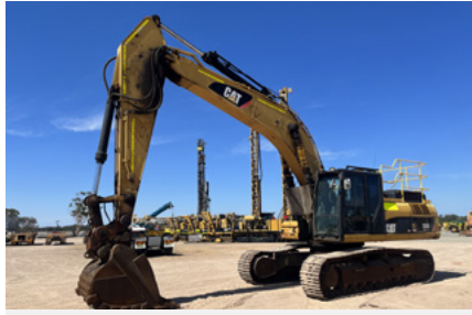
1 of 2 - 2013 Cat 336DL