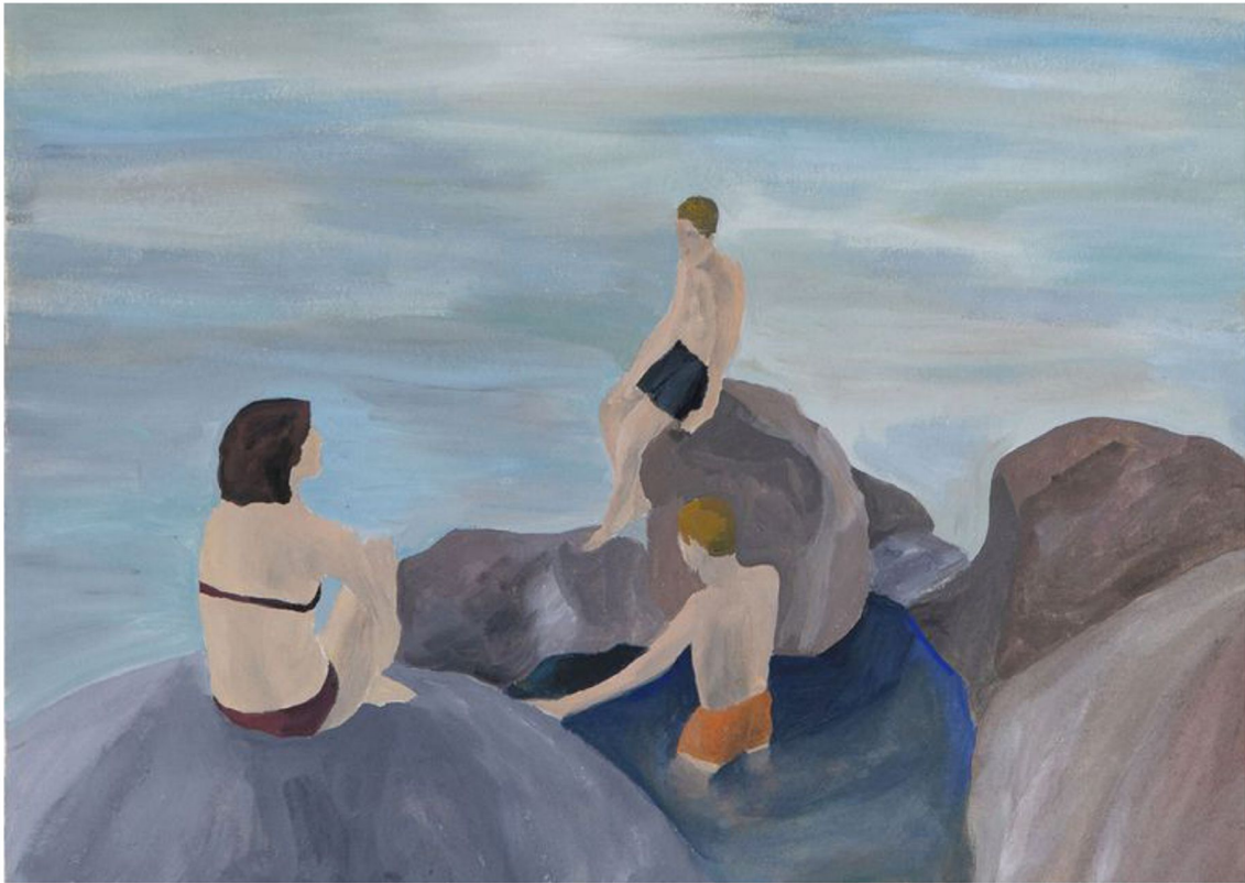
Erve, gouache on paper, 28x20cm, 2020