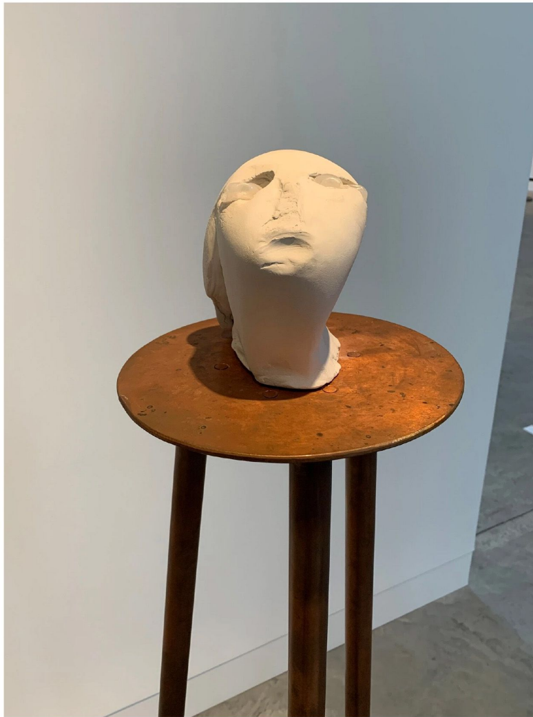
"Senza titolo (Untitled)," by Marisa Merz, who died last year.

Now, there's also a special show, "Homemade," in the last gallery, featuring work made by eight Italian artists quarantined in New York during the pandemic. It began as an online and Instagram invitational, and morphed into a real exhibition.