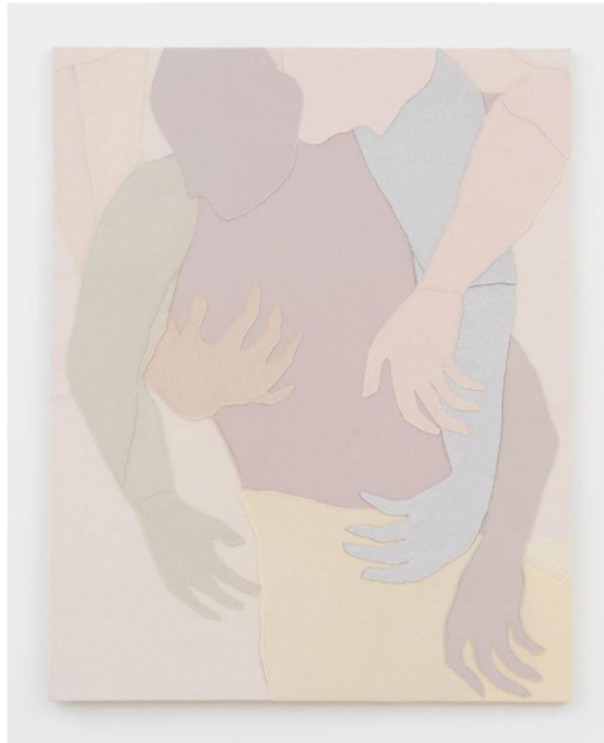
Untitled (Air India, Emirates, Air France, Continental, EVA Air, Korean Air and LATAM Airlines), airlines blankets, 152x121cm, 2019

It changes constantly. Perhaps what leaves its mark the most is the work of artists who live with us, in that community of people I was talking about a little while ago and who share thoughts and fears with you.