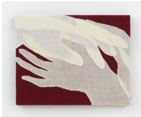
Untitled (Continental, Air France and Avianca), airlines blankets, 35x27cm, 2019