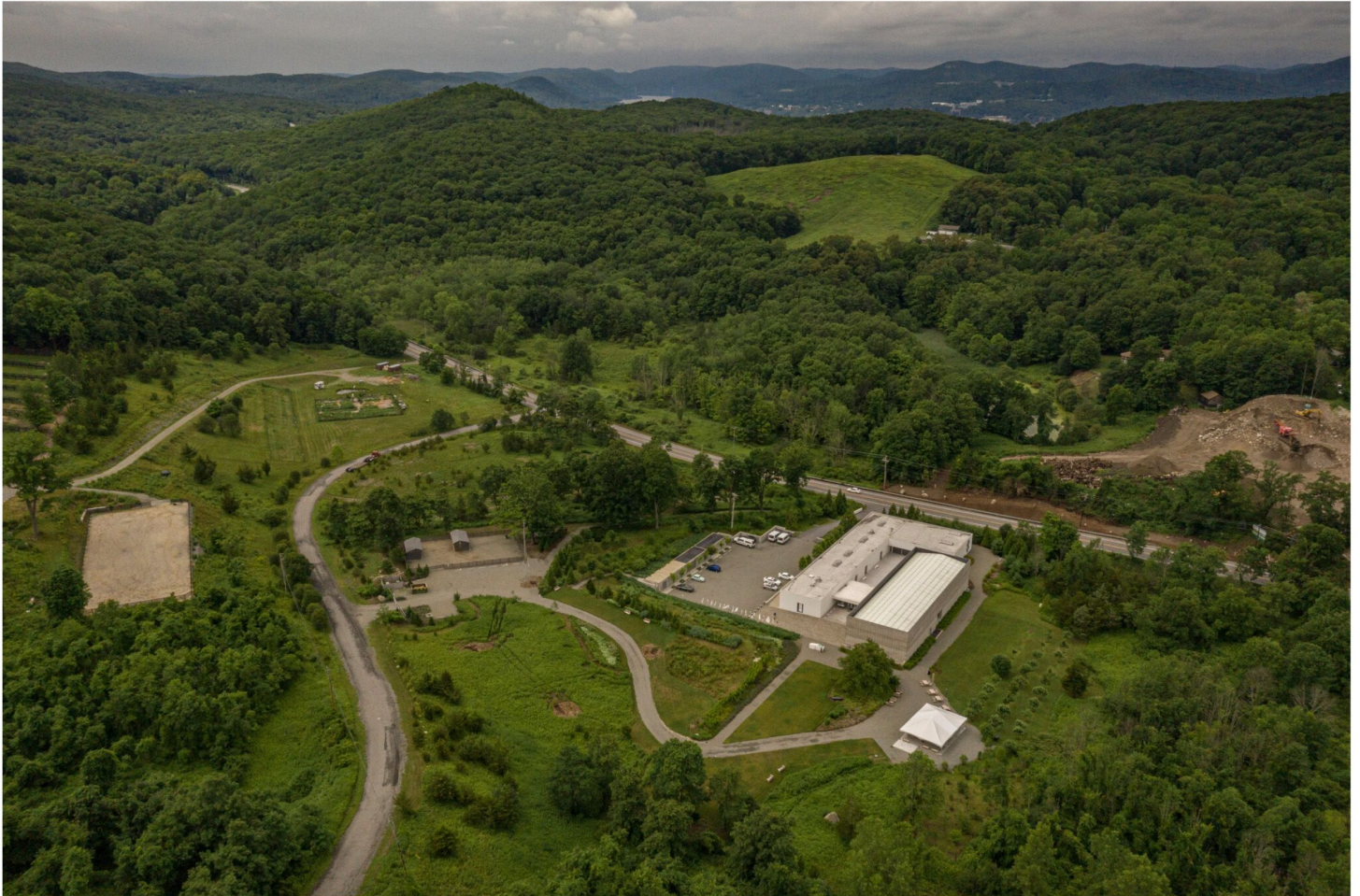
An aerial view of Magazzino Italian Art in Cold Spring, N.Y., which is hoping to expand with a pavilion for rotating exhibitions as well as a children's program.

The technology is currently in use at the Duomo in Florence, Italy, and the Leaning Tower of Pisa.