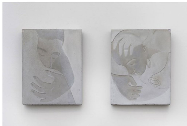
Untitled (Hug II) and Untitled (Hug I), casted cement, 20x25cm, 2020

Work on an exhibition that will open in Shanghai in the autumn and above all find a way to return to Italy to meet my new nephew.