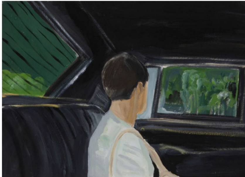
Fort Greene Park, gouache on paper, 28x20cm, 2020

I think that alone we don't go very far and that a priority should be to create a solid community of people around us with whom we can establish an honest dialogue so that we can feel part of a larger common project - perhaps in this sense. work will affect a system.