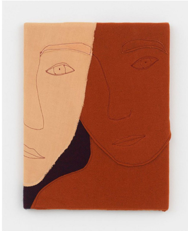
Untitled (Philippine Airlines, Avianca and Delta), airlines blankets, 35x27cm, 2019