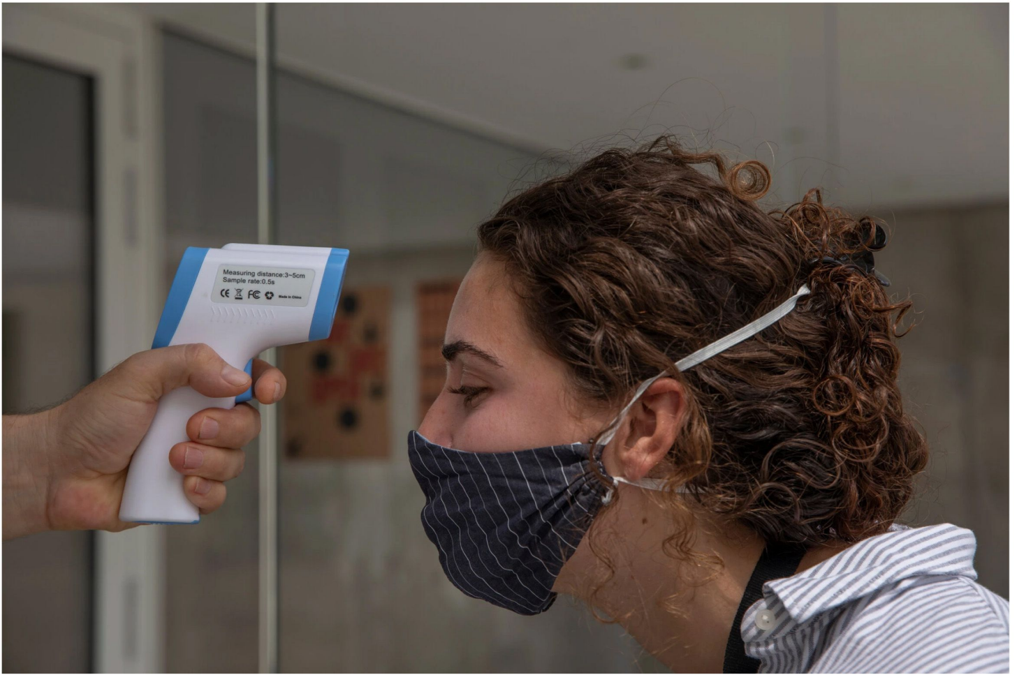
Temperatures are checked before visitors enter the building.

The museum, which was closed for four months, is admitting 10 people per half-hour via advance reservation, and it assumes a 90-minute visit. It could have more visitors, according to state and county guidelines, but they decided to start cautiously.