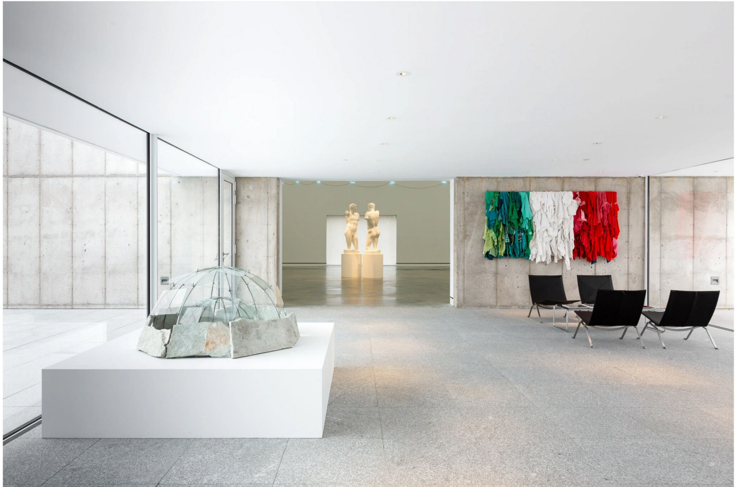
View from Magazzino's lobby, from left: Mario Merz, "Senza titolo" (1984); Giulio Paolini, "Mimesi" (1976-88); Michelangelo Pistoletto, "Stracci italiani" (2007).

The current selection starts in the lobby, with Mr. Pistoletto's reinterpretation of the Italian tricolor flag, made with rags, "Stracci italiani" (2007). Inside the galleries, his cheeky "Adamo ed Eva" (1962-87) is a portrait of a naked couple on polished stainless steel, so that the viewer can't help but enter the picture when standing in front of it. At 87, he is still working.