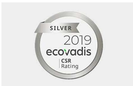
EcoVadis Silver Rating

www.mercateo.com/corporate/presselounge/pressemitteilungen/