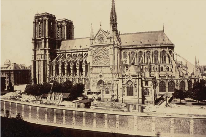
Unknownmaker, French; Paris, Notre-Dame , about 1870, Albumen silver print; 26.4 × 20.6 cm (10 3/8 × 8 1/8 in.), 84.XP.492.14; The J. Paul Getty Museum, Los Angeles