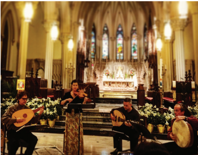
Photo of ALBA Consort