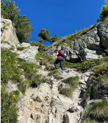
Ridge Basso d'Alou - Dent de Nendaz

Alternative Tracouet with descent by telecabine