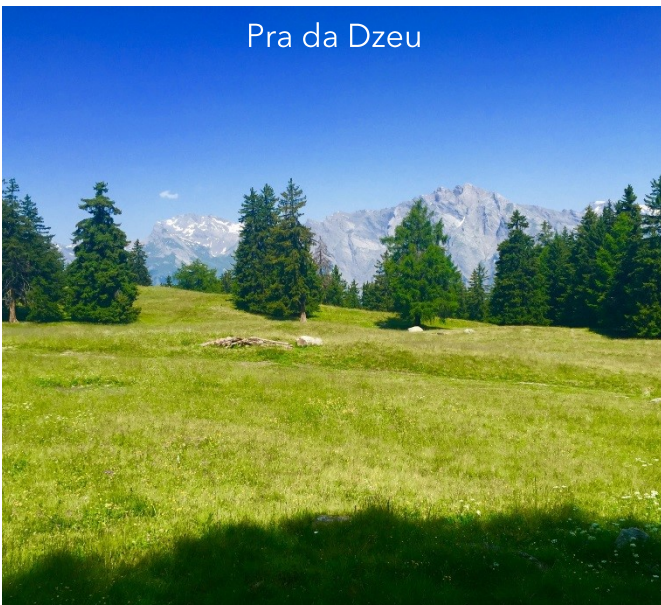
Pra da Dzeu