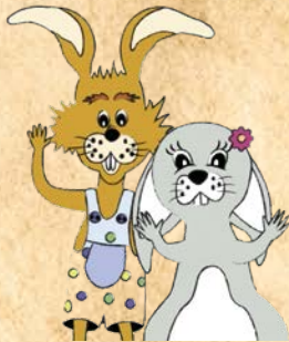
Waldi & Bella