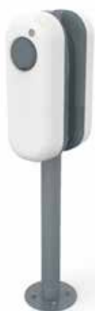
Pole for two NewMotion charge points