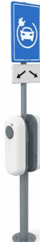
Pole for two NewMotion charge points & signage