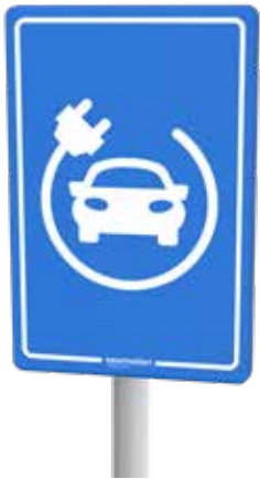
“charging location” *

The signage can be mounted on the wall (wall mounts are provided by default with the charge point) or on a pole.