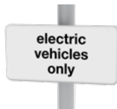
“electric vehicles only” *