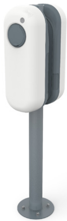
Pole for two NewMotion charge points