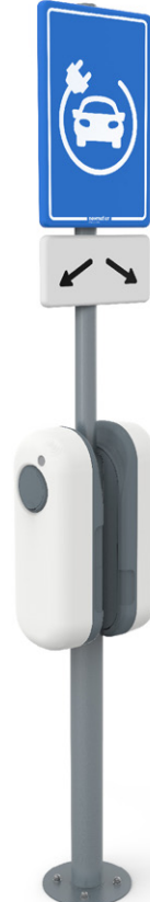
Pole for two NewMotion charge points & signage