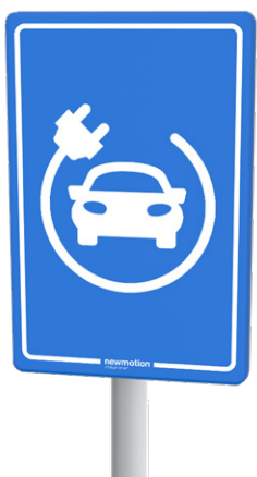
“charging location” *

The signage can be mounted on the wall (wall mounts are provided by default with the charge point) or on a pole.