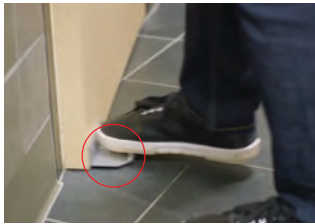
Install a foot pull-handle and a dormakaba door closer onto the door.

One aspect of safety demanded by the building industry today is on health and hygiene. Hygiene is one of the most important things in our lives – from city planning, facilities management and private living. Even your door can make the difference when it comes to a clean and