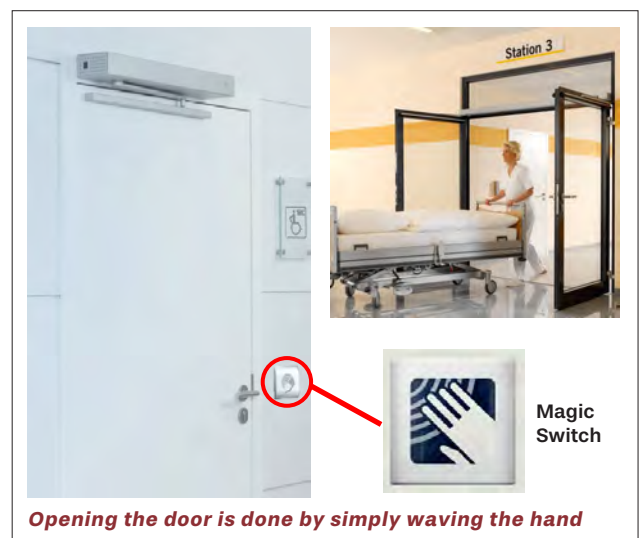
Opening the door is done by simply waving the hand