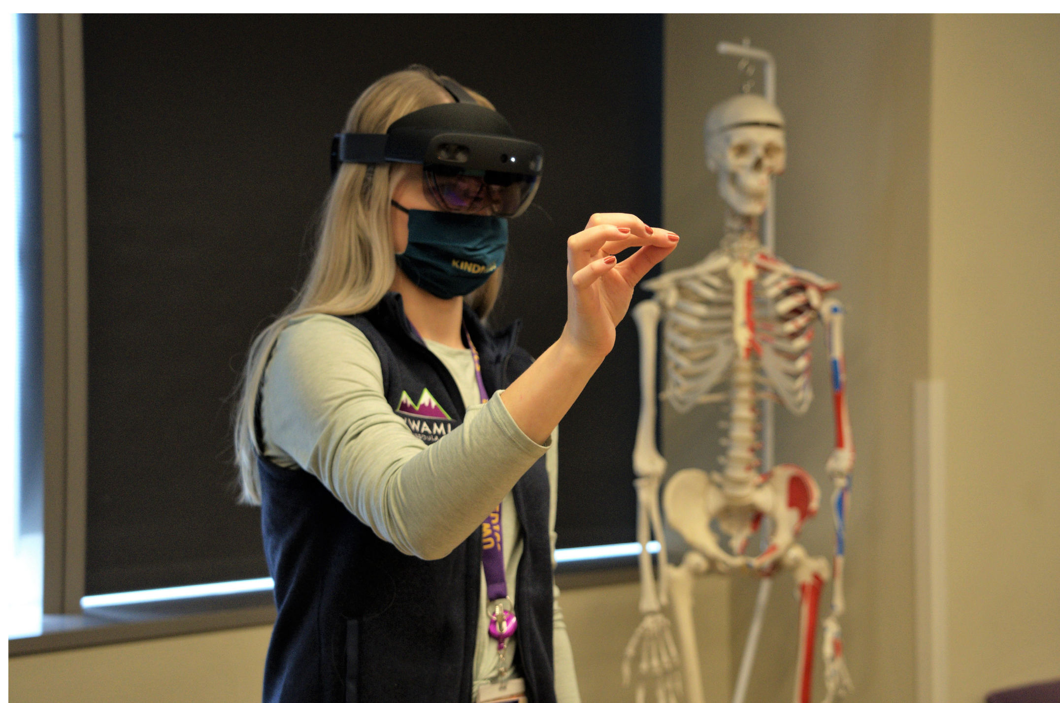
Resident using AR-Tho's ability to switch between anatomical layers to learn 2D to 3D spacial awareness.

Created physical models to provide tactile feedback