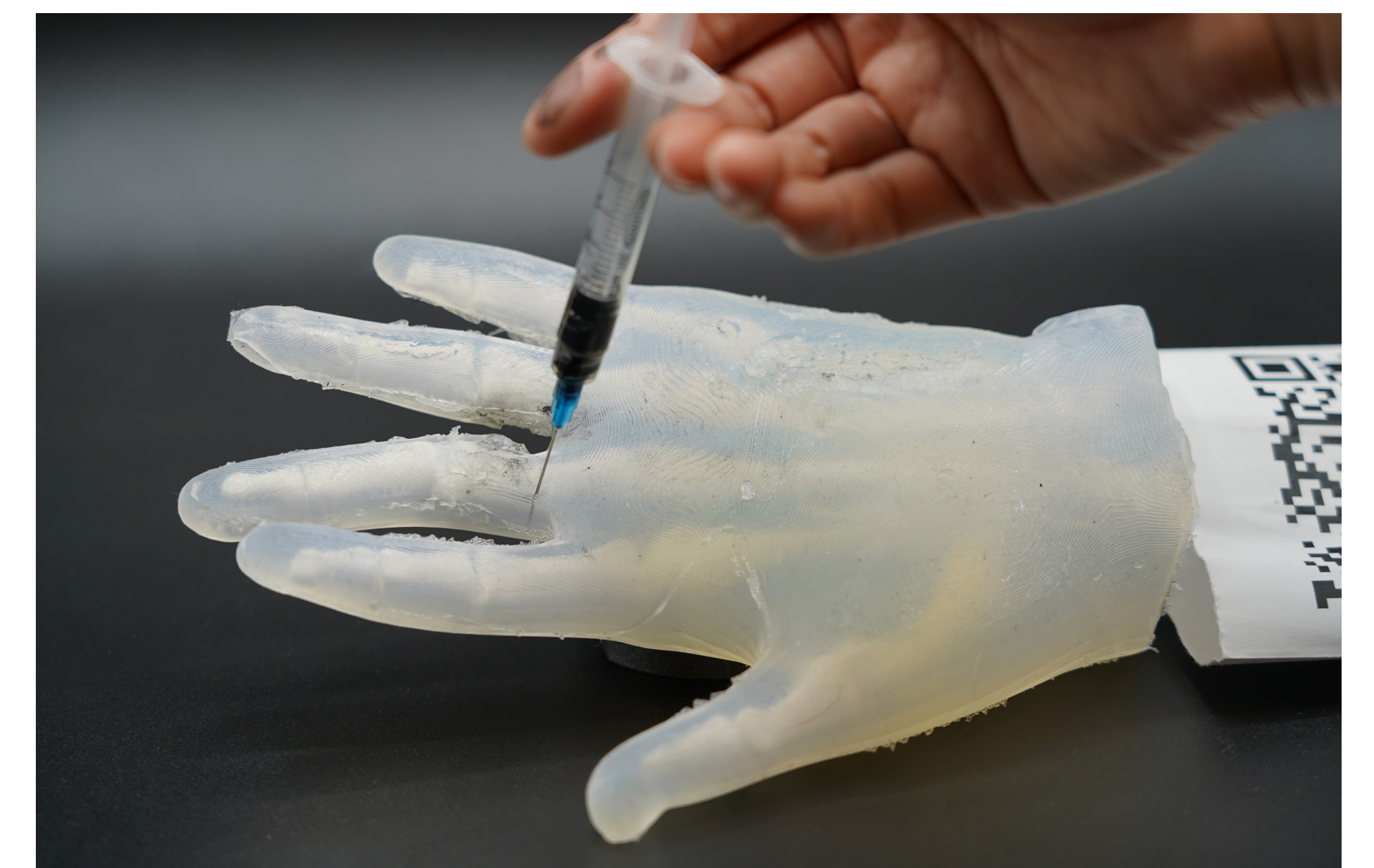
User practicing injecting anesthetic (i.e. a digital block) into a 3D printed hand model encased in silicon. AR-Tho helps train users to avoid damaging soft tissues and veins during similar procedures.