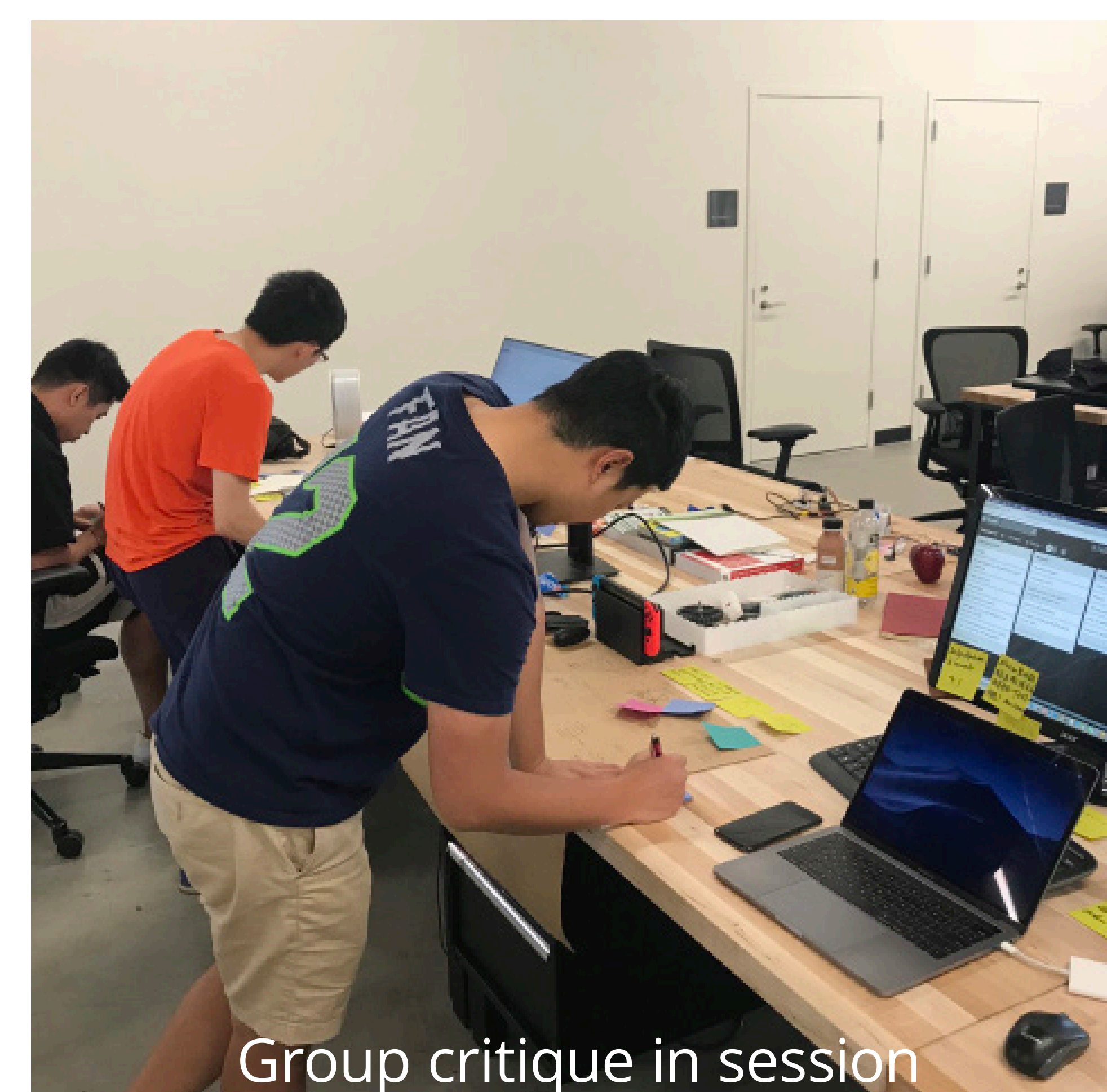
Group critique in session