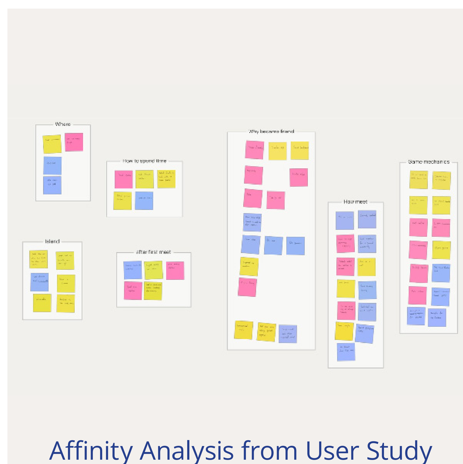
Affinity Analysis from User Study