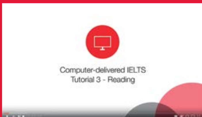
Computer-delivered IELTS Reading test tutorial