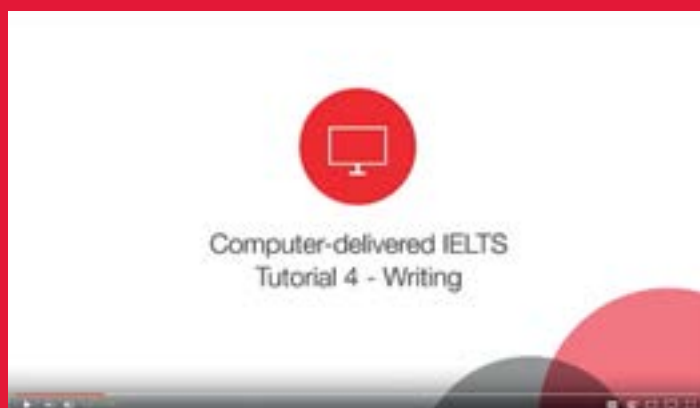
Computer-delivered IELTS Writing test tutorial