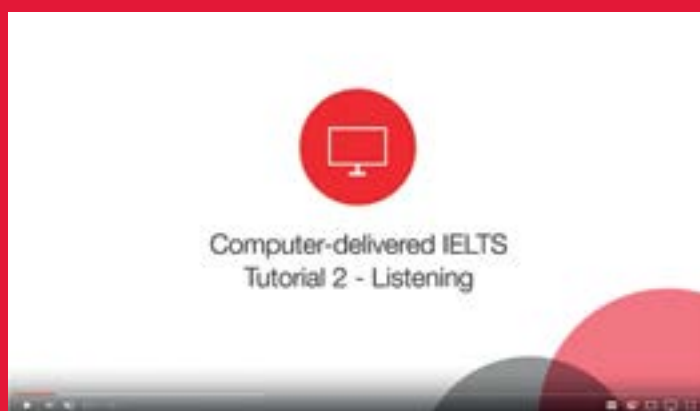
Computer-delivered IELTS Listening test tutorial